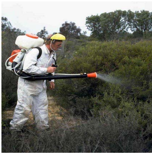
Figure 4 Foliar application of phosphite by backpack mister (Photo: B Shearer, Department of Conservation, Western Australia).

The cost of phosphite application precludes broadscale application to infested sites. The use of phosphite and/or ex-situ conservation as a component of integrated management for a site or area requires a process of prioritisation and strategic planning. Highest priority may be given to sites assessed as ecologically or economically significant, or valued by the community.