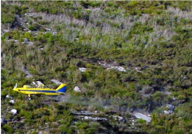
Figure 3 Aerial application of phosphite in Stirling Ranges National Park in the south-west of Western Australia (Photo: G Freebury, Department of Conservation, Western Australia).

This is a draft for public comment produced by the Department of the Environment and Water Resources and should only be used to assist in providing comments to the Department during the public comment period.