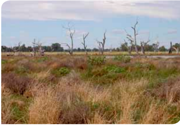
Macquarie Marshes.

The key objective for the workshop was to describe the ecological community's key diagnostic features, such as its landscape position, where, when and to what extent water is present in these wetlands and their characteristic biotic elements. Possible condition thresholds for the ecological community were also discussed. Condition thresholds help to distinguish between wetland areas of good and poor quality, and guide the determination of significant impacts and can assist with planning management and recovery actions. The challenging issue of wetland boundary delineation was discussed, including indicators that may be useful in dry conditions. Buffer zones were also looked at as well as how groundwater and groundwater dependent ecosystems should be considered. The importance of connectivity to the protection of the broadest range of habitat for water dependent flora and fauna was highlighted.