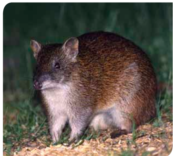
Isoodon obesulus subsp. obesulus (southern brown bandicoot) occurs in the two Victorian volcanic plain ecological communities

This approach was identified as a priority in the Australian Government's response to the recent review of national environment law. Both ecological communities have been identified as a priority for national listing (continued page 5)