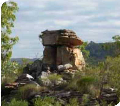
Arnhem Plateau Sandstone Shrubland Complex

Three ecological communities have been listed as threatened under national environment law. They are: