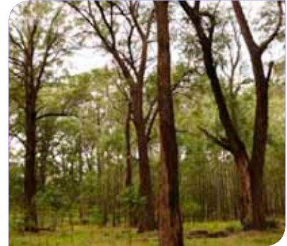
Eucalyptus fastigata Mt Gibraltar

The critically endangered Lowland Rainforest of Subtropical Australia, which occurs in northern New South Wales and southern Queensland.