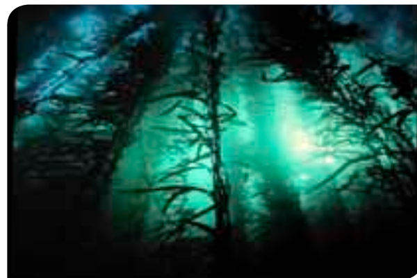
Macrocystis pyrifera (giant kelp).

The comment period for the Murray Valley Natural Grasslands of the Southern Riverina Bioregion closes on 23 December 2011 and the comment period for the Giant Kelp Forests of South East Australia closes on 18 January 2012. The comment period for the Long Lowland and Floodplain Rivers of the Macleay/McPherson Overlap closes on 2 February 2012