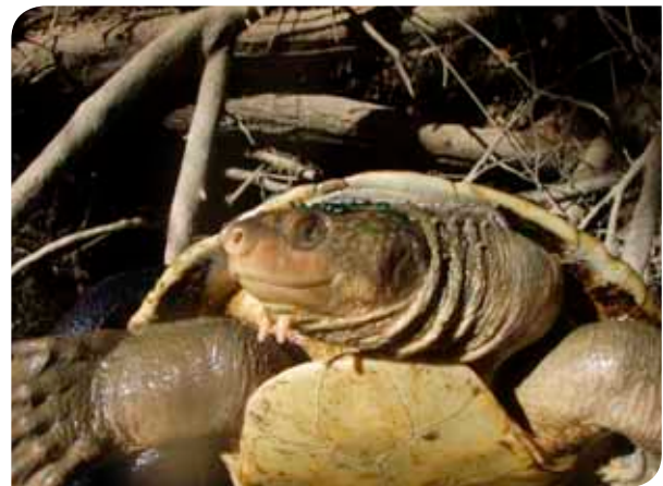
Elusor macrurus (Mary River turtle)

Wallum, in this instance, refers to coastal, healthy, nutrient-poor acidic rivers. The Macleay/McPherson Overlap is a transition zone between temperate and subtropical ecosystems and incorporates the most eastern parts of the Australian mainland. It is an area of exceptionally high biodiversity; the southern limit for many tropical species and the northern limit for many temperate species. It stretches from Bundaberg in Queensland, south to near Port Macquarie in New South Wales, and west to the Great Dividing Range. The ecological community