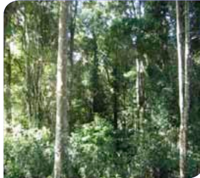
Lowland Rainforest of Subtropical Australia

The endangered Arnhem Plateau Sandstone Shrubland Complex, which occurs mainly on the Arnhem Plateau in the Northern Territory.