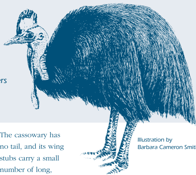
Illustration by Barbara Cameron Smith

The southern cassowary is one of Australia's most imposing birds — large, colourful, and flightless. It is found only in the dense tropical rainforests of north-east Queensland. Continuing clearing and fragmentation of rainforest, and increased mortality from cars and dogs have reduced cassowary numbers to perhaps as few as around 2000, threatening the species with extinction.