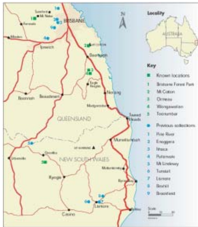
Figure 2: Distribution of Corchorus cunninghamii populations in Australia (from Parr, 2001).

cunninghamii populations. These were at Brookfield, Ormeau (Darlington Range) and Wongawallan in Queensland, and at Toonumbar in N.S.W. Further information regarding existing populations of the species in N.S.W. can be found in the N.S.W. recovery plan for C. cunninghamii (N.S.W. National Parks and Wildlife Service, 1999) and in Stewart (2000).