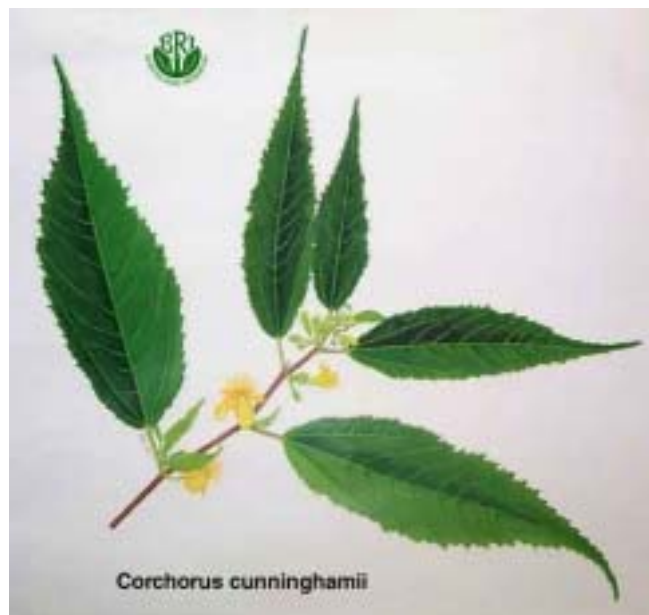
Figure 1: Corchorus cunninghamii . Diagram provided by the Queensland Herbarium

Other descriptions of the species may be found in Stanley and Ross (1986), Harden (1990) and Halford (1995a; 1995b).