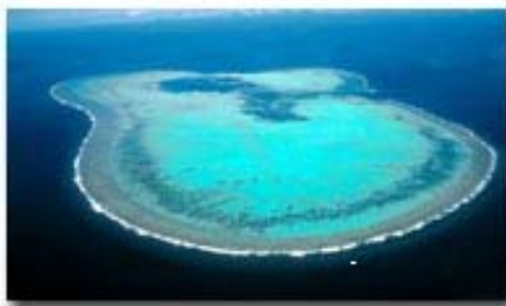
Elizabeth Reef from the air

The Minister for the Environment and Heritage, Senator Ian Campbell, said the plan would create new protection zones while still allowing recreational access.