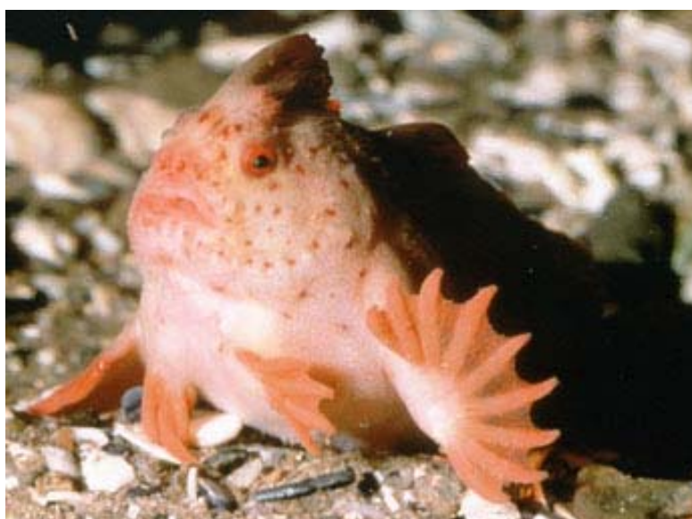
Red handfish

The Department of the Environment and Heritage (DEH) is calling for proposals to fund projects that will contribute to the implementation of recovery plans for several threatened species.