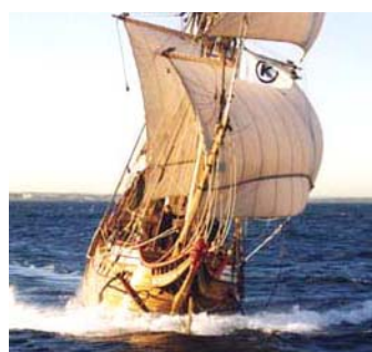
The replica “Duyfken”

A key component of the focus on coastal and maritime heritage is the Australian Government's sponsorship for the Duyfken replica voyage around Australia, which will give Australians a once in a lifetime opportunity to experience a working 16th century vessel.