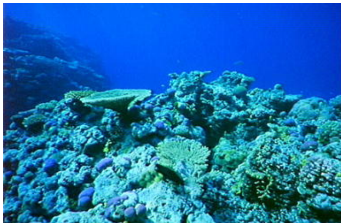
Landscape at Davies Reef

The Minister for the Environment and Heritage, Senator Ian Campbell, said that the Act had not been reviewed for some time and needed to be updated to ensure that it worked in harmony with the Australian Government's Environment Protection and Biodiversity Conservation Act 1999 , the primary legislation for environmental regulation.