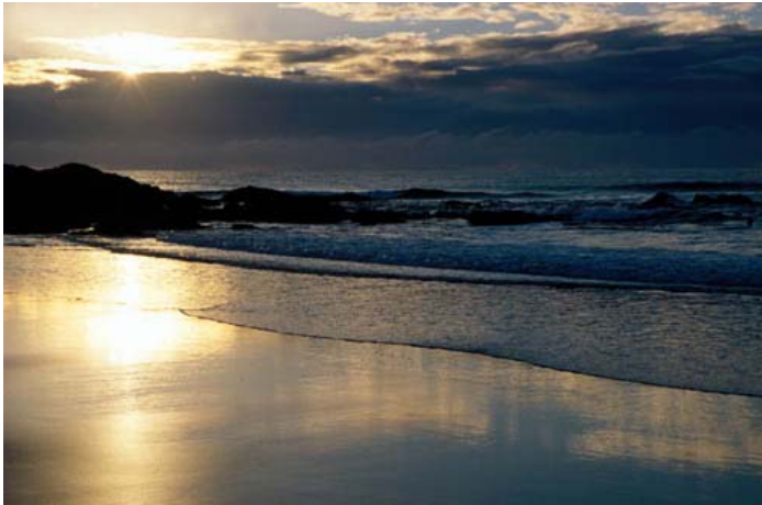
Coastal scene, NSW

The need for sustainable coastal and marine use, planning and management is increasingly hard to ignore. In and around Australia we are seeing more natural disasters, higher demand to live on the coast, more certainty in climate change research, continuous battles with weeds, new marine pests and dwindling fish populations. Coast to Coast will focus debate across the full range of coastal and marine issues being considered at national, state, regional and local levels.