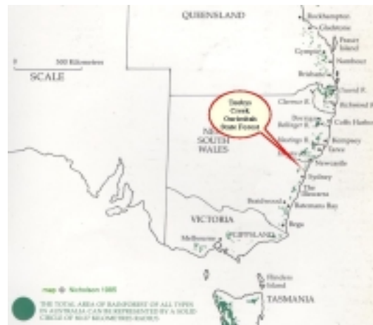
Figure 1: Map of SE Aust Rainforests, highlighting Ourimbah