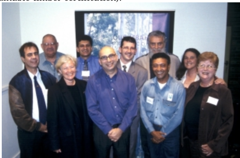
Figure 2. Minister Costa’s PR team used the agreement to show how forward-looking and community-friendly his department had become.

Forests PR made much of the ‘historic agreement’ which made community concerns explicit (concern that logging was occurring in inappropriate areas, and that creeks were not being given due respect) and specified the way forward (basically a trial community forest management project, a step towards obtaining credible sustainable timber certification).