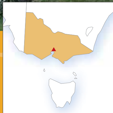
Newman College Date of inscription: 21 September 2005 ICI Building (former)/Orica House Date of inscription: 21 September 2005