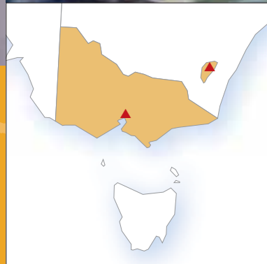
Australian Academy of Science Building Date of inscription: 21 September 2005