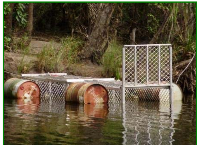
Image 4 – A baited croc trap – The bait is attached to a rope that holds open the trap door. When a croc swims in and takes the bait, it pulls on the rope and this releases the pin on trap door, which snaps shut behind it.