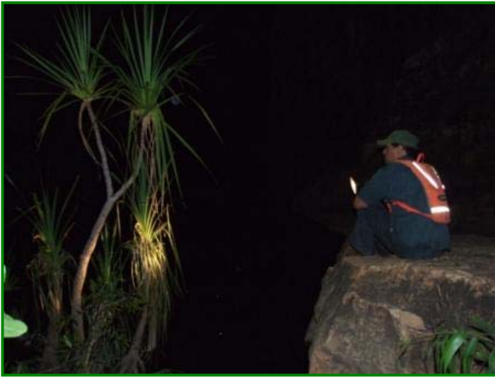
Image 5 – Night time spotlighting surveys – In addition to setting croc traps, we also conduct night time surveys where spotlights are used to pick up eye-shines of any crocs that haven't been trapped yet.