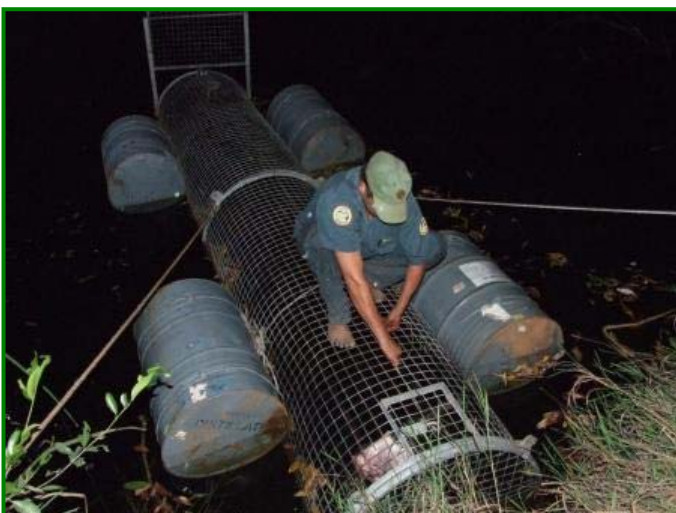
Image 3 – Baiting a croc trap – This is one of the traps in the Maguk area. Rangers set traps in all of our crocodile management zones to remove any estuarine crocs so that visitors can safely access the area.