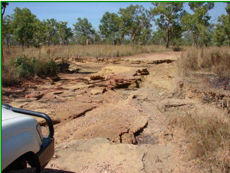
Image 1 – Washouts on the road to Maguk – before repairs – After each wet season, many of the unsealed roads require significant work to restore them for visitors. They need to dry out first, so that we can get the heavy machinery onto them so that they can get the repairs underway.

Park staff aim to open visitor sites as soon as is practicably possible. The images below and on the following page showcase the work required to get various sites ready before they can open to the public. Changes which have been made to earlier forecasts are highlighted in yellow.