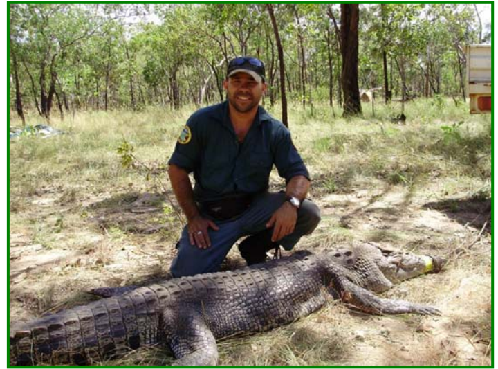
Image 6 – This large croc came out of Jim Jim creek last week. To date, there have been four estuarine crocs removed from the Jim Jim and Twin Falls area and final croc surveys are underway.