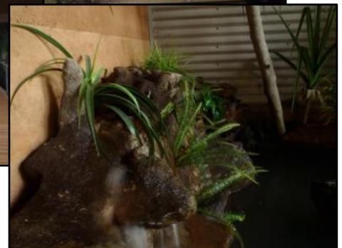
Right: New plants in the Bowali Billabong display appreciate the large skylight which was recently installed.

For more information about Kakadu National Park contact Bowali Visitor Centre on (08) 8938 1120 or visit our websites www.parksaustralia.gov.au/kakadu or www.kakadu.com.au