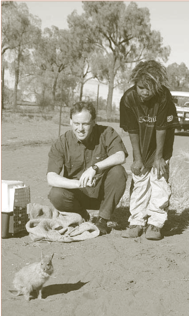
The Hon Greg Hunt MP, Parliamentary Secretary to the Minister for the Environment and Heritage with Abraham Kitson as they release a mala (rufous hare wallaby) at Uluru

The Hon Greg Hunt MP was appointed Parliamentary Secretary to the Minister for the Environment and Heritage, Senator the Hon Ian Campbell, on 26 October 2004. Mr Hunt has ministerial responsibility on behalf of Senator Campbell for terrestrial Commonwealth reserves established under the Environment Protection and Biodiversity Conservation Act 1999 , and for the Director of National Parks. Senator Campbell retains responsibility for Commonwealth marine reserves.