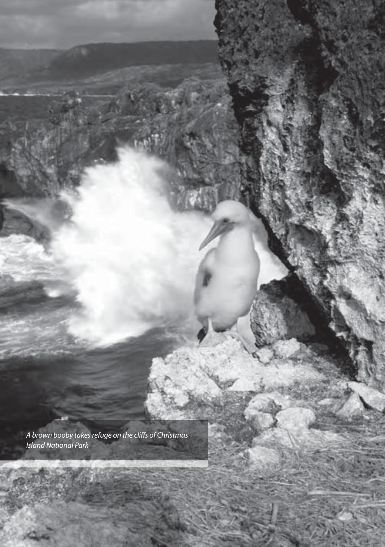
A brown booby takes refuge on the cliffs of Christmas Island National Park