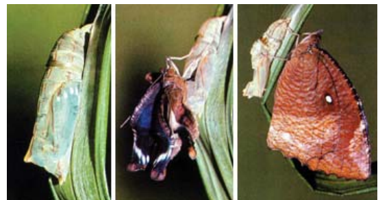
Chrysalis | Butterfly emerging | Butterfly drying its wings

After mating, the female butterfly lays her eggs in a leaf surface of a specific food plant; each species of butterfly has its particular species of food plants. The eggs are usually laid