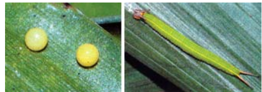
Butterfly eggs | Caterpillar

Butterflies are insects belonging to the order Lepidoptera in which two pairs of wings as well as the legs and body are covered with scales. They have a coiled proboscis which is used for sucking up liquid foods such as nectar from flowers. Their chewing mouthparts are imperfect or totally absent. Lepidoptera comes from the Greek words lepis (a scale) and pteron (wing), meaning 'scale-wing'. The Lepidopterans are normally divided into butterflies and moths.