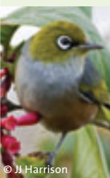
Silvereye Zosterops lateralis