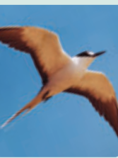
Sooty tern Sterna fuscata

Flushed with rose on the breast and black borders on the wings, you will see these spectacular snowy-feathered seabirds between October and May. Using their two bright scarlet tail quills, they perform elaborate and unique courtship rituals that can include hovering in a vertical position or even flying backwards.