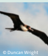
Greater and lesser frigatebirds Fregata minor and F. ariel

Two subspecies of this little bird are known to visit Norfolk to breed. They are black on the back with some white on the face, extending to a white belly and underwings which appear to be edged in black. At only 25-30 centimetres in length they are one of the smallest species of shearwater in the world.