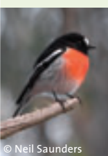
Scarlet robin Petroica multicolor multicolor