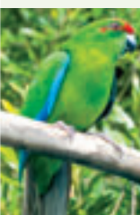
Green parrot Cyanoramphus cookii