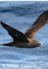
Wedge-tailed shearwater Puffinus pacificus