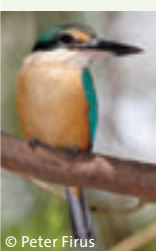
Sacred kingfisher Todiramphus sanctus norfolkiensis