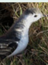
Little shearwater Puffinus assimilis

These graceful birds are snow-white except for their black bills, feet and eyes. Often flying in pairs, they are a symbol of Norfolk Island's summer sky. Fairy terns (as they are referred to locally) normally leave the island in May to spend several months at sea, flying constantly before returning in mid-August to mate.