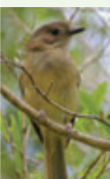
Golden whistler Pachycephala pectoralis xanthoprocta