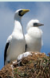
Masked booby Sula dactylatra fullagari

If you look out to the ocean at sunset you may see these birds floating on the water before coming ashore just after nightfall. Known to locals as 'ghost birds', you may hear their moaning calls echo across the island at night. Shearwaters cover vast distances during their annual migration, travelling as far as 300 kilometres a day on their way to Norfolk to breed.