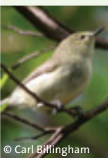
Grey gerygone Gerygone modesta

These small, inquisitive birds are grey and brown with white markings, and never seem to stay still, flitting their fan-like tail as they move. They are not shy and may follow you along the walking tracks, singing in a vigorous chatter. Grey fantails live in forests and gardens across the island.