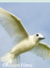
White tern Gygis alba

Also known as black noddies, you can recognise these birds by their black-brown feathers and distinctive white patch on the top of their heads. During summer, many of the tall trees become home to large numbers of white-capped noddies. They are known locally as 'titeracks' – a sound similar to an adult bird's call.