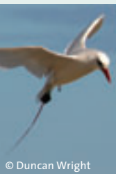
Red-tailed tropic-bird Phaethon rubricauda roseotincta

These large and distinctive seabirds have a white body, black tail and a small black mask around their large yellow or yellowish-green beak. Phillip Island, Nepean Island and the Norfolk islets are the main local breeding areas for the masked booby. You can often see these birds at their nests between August and February. See if you can spot a chick – they are nearly as big as their parents.