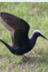
White-capped noddy Anous minutus

With their sooty grey back and white underside, you might see these birds in large noisy flocks of thousands returning to one of Norfolk's offshore islands to breed. The local name for these birds is the whale bird, as they arrive back on Phillip Island at the same time as the spring/summer whale migration.