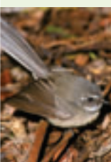
Grey fantail Rhipidura fuliginosa pelzelni

The melodious 'wh-wh-wh-wit - seep' is one of the most beautiful birdsongs in the Norfolk forests. Whistle back and you just might begin a 'conversation' with these curious birds (known locally as tameys). Males and females look similar, brown above with a pale gold underside that becomes brighter during breeding season.