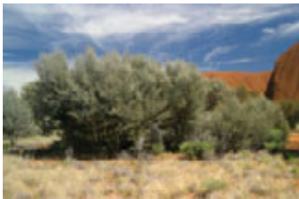
Left to right - puti habitat is dominated by wanaṛi and pila habitat is dominated by tjanpi

Pila (spinifex plains) - is the most common habitat in the v and many kurkaṛa (desert oak) grow in pila . When tjanpi (spinifex) is old, with a ring in the middle, Anangu burn it to allow new growth. Trees and shrubs such as kurkaṛa , waṭarka (umbrella bush) and muur-muurpa (bloodwood) provide seeds for animals and people to eat. Many plants provide nectar and honey such as the common kaliny-kalinypa . Some of the animals of the pila are tarkawara (spinifex hopping mouse), muṭinka (skink lizards) and muluny-mulunypa (striped skinks), kuniya (woma python), lungkaṭa (Centralian blue-tongued lizard), tjakura (great desert skink), kaḷaya (emu), kipaṛa (bustard), tuuka (fox) and ngaya (cat).