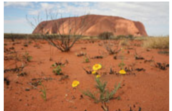
Left to right - pila habitat, dominated by spinifex is the most common habitat in the park and nyaru is an area that has been recently burnt