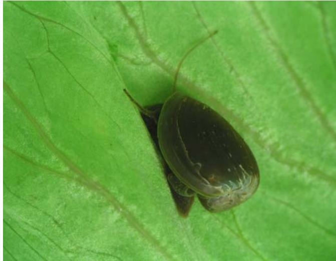
Figure 1 Amerianna cumingi