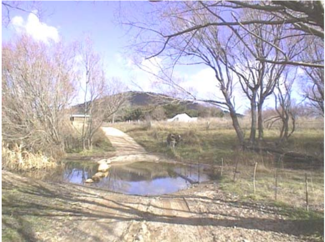
Gillatotong Ck, Braidwood NSW