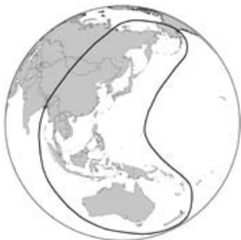
East Asian-Australasian Flyway

The Environment Protection and Biodiversity Conservation Act 1999 (EPBC Act), identifies, as a matter of national environmental significance, the migratory species that Australia protects under various international agreements and conventions. The EPBC Act provides for developing and implementing Wildlife Conservation Plans to protect, conserve and manage listed migratory species. The species