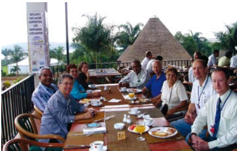
Images from Cop9 of nearby Ugandan environs and members of the Australian delegation in action.