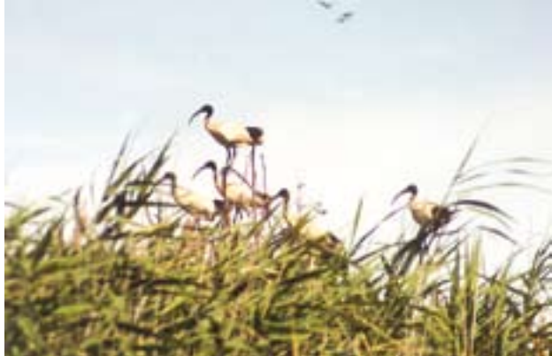
The forest supports large breeding colonies of Australian White Ibis.