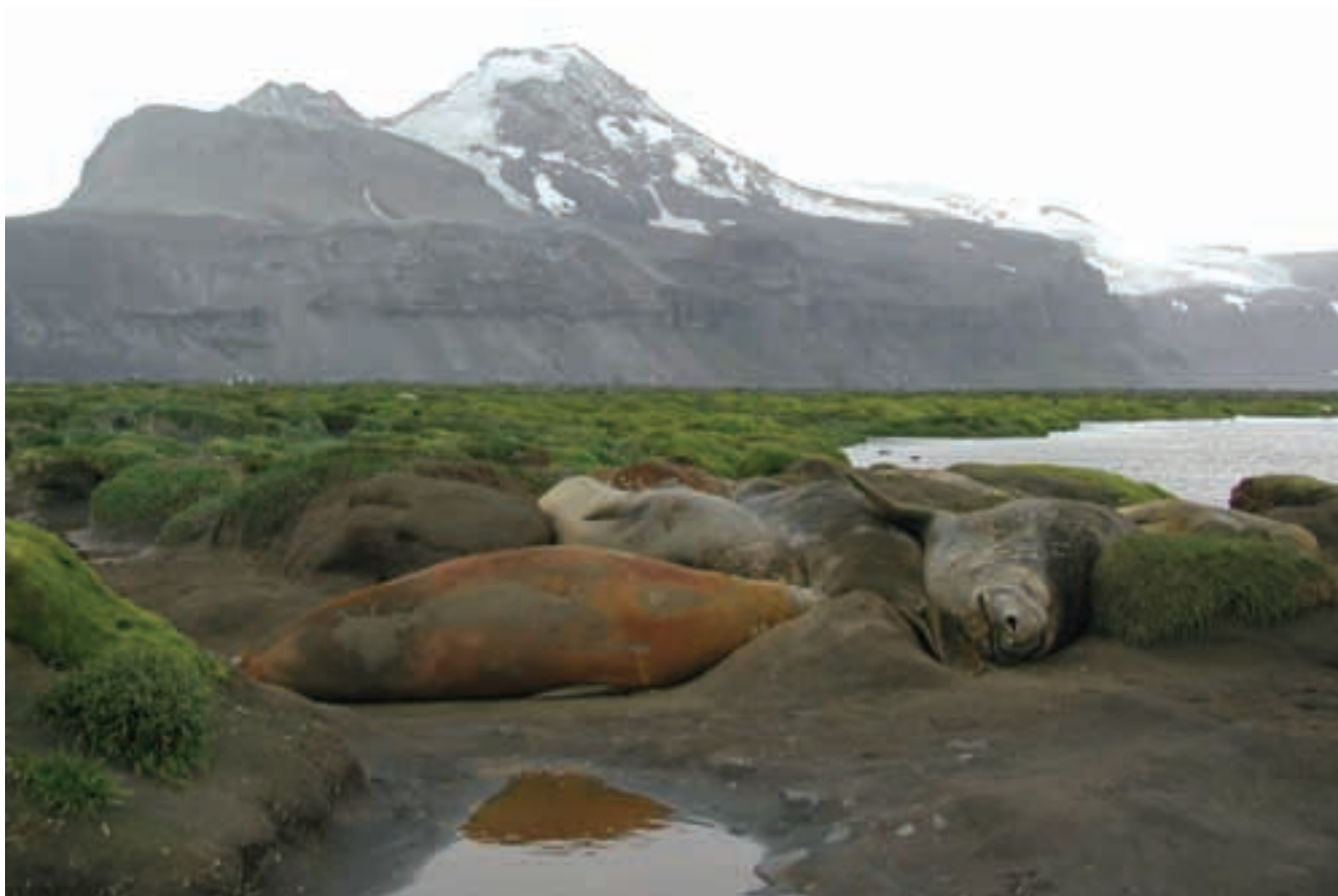
Southern elephant seals ( Mirounga leonina )—a listed threatened species—use the coastal "pool complex" wetlands near Atlas Cove on Heard Island to breed and moult during Spring and Summer.