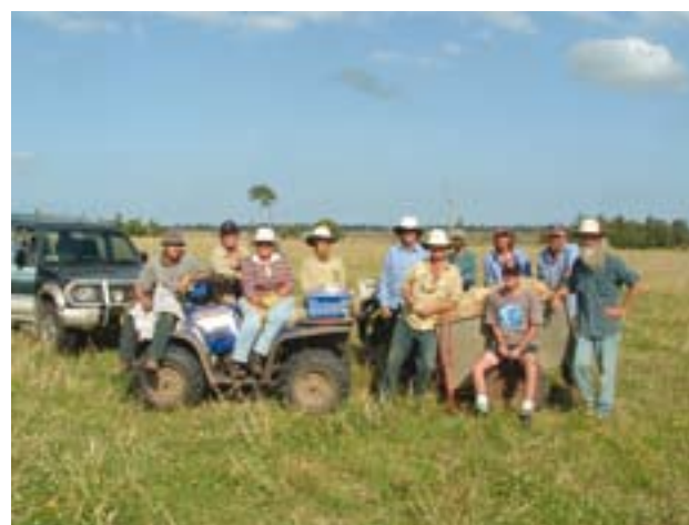
EnviTE team and landholders working to restore the Bungawalbin Catchment

The Myer Foundation provided $27,000 to address community concerns about poor water quality in the lower Bungawalbin and Sandy Creeks. The Bungawalbin region contains areas of extensively drained backswamps (a type of coastal floodplain swamp). These backswamps have become