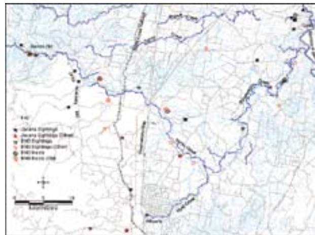
Map of Black-necked Stork and Jacana sightings showing Bungawalbin Catchment.

The project has been particularly successful in building fencing to restrict stock access to the region's fragile riparian zone. Fencing was constructed and weeding undertaken by a dedicated Green Corps team for the first six months, aided later by contractors and available EnviTE bushland regeneration teams. So far 8,000m of riparian fencing has been completed, with a further 5,600m supplied and awaiting