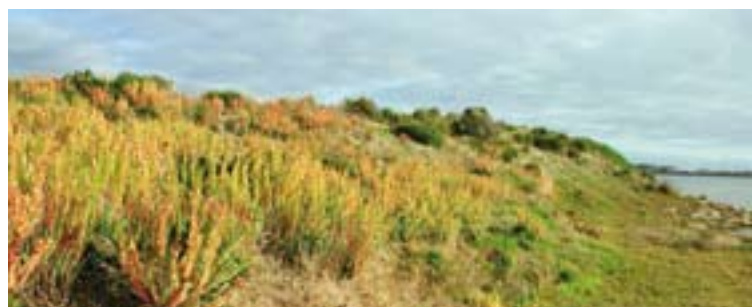
Noonameena Point, Coorong, South Australia.

example they have an outstanding Native Title claim on areas which include the Ramsar site and they were concerned that participating in the ecological character description project might harm their claim.