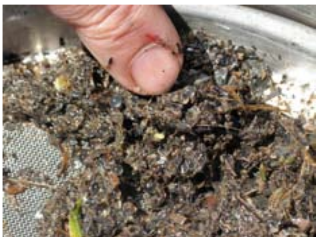
Golden and Silver Perch eggs spawned during high river flows.

From mid October 2005 through to January 2006, up to 500 GL of environmental water is being made available by the Victorian and NSW governments through the Barmah-Millewa Forest Environmental Water Allocation. This will complement River Murray flows that have resulted from recent good rains.