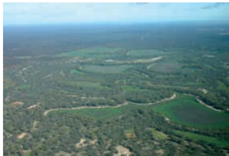
Aerial Photos of the Hattah Lakes (Lakes Brockie, Bulla, Arawak and Hattah).