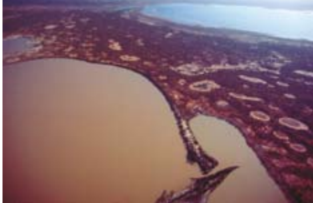
An aerial view of Currawinya.

In periods of high water levels, many bird species from the coast breed in this site. Examples of these species include Australian pelican ( Pelecanus conspicillatus ), Red-necked Avocet ( Recurvirostra novaehollandiae ), Royal Spoonbills ( Platalea regia ), Yellow-billed Spoonbill ( Platalea flavipes ) and White-necked Heron ( Ardea pacifica ).