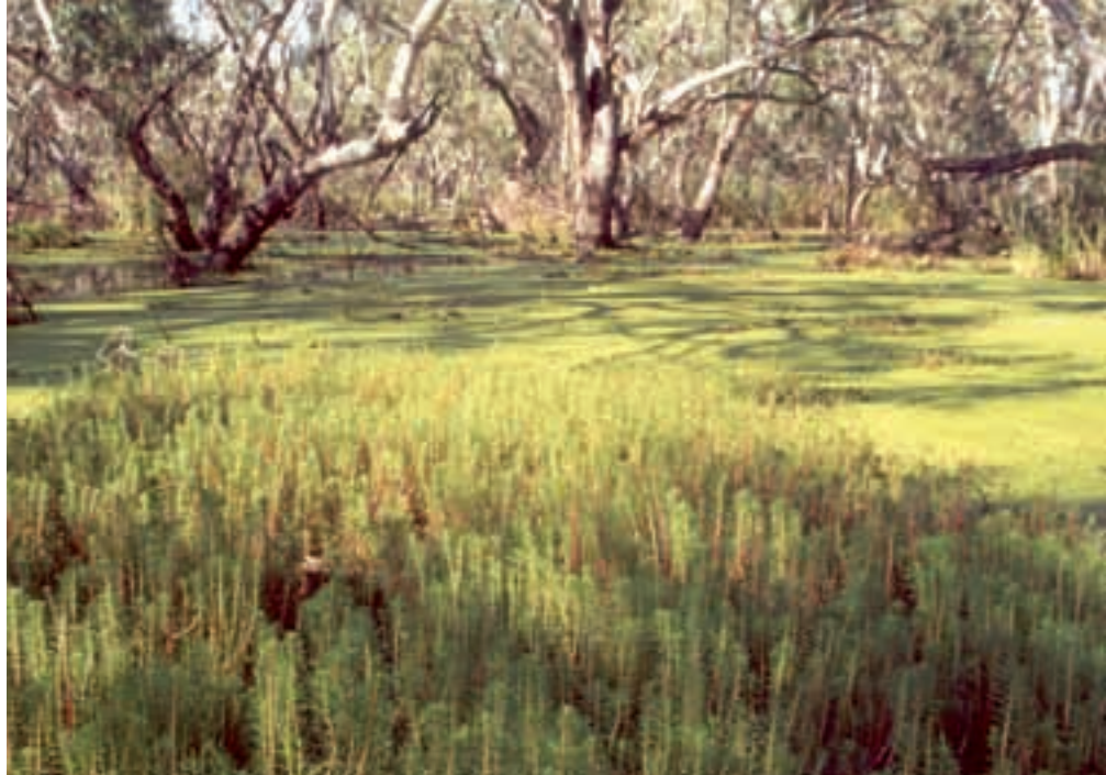
Macquarie Marshes, NSW.

The NSW Wetland Recovery Plan is a suite of projects developed to deliver long-term and permanent benefits to ecologically significant wetlands through water efficiency projects, water buy-back, and projects to improve wetland management in the Macquarie Marshes and Gwydir Wetlands.