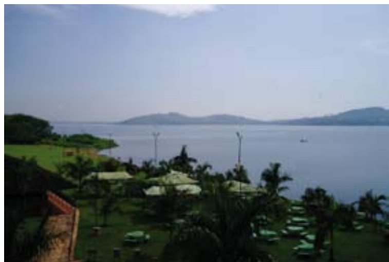
Lake Victoria.

The traditional elders from the Paroo delivered a first class presentation on the values of the Paroo River Wetlands—a site which is being considered for nomination as a Wetland of International Importance under the Ramsar Convention.