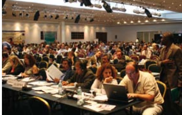
Delegates gather for the conference.

Working closely with New Zealand and the Pacific Island countries, we were extremely influential in shaping a number of the CoP's major decisions, including agreements on Avian Influenza, the sustainable use of fish resources and the budget for the Ramsar Convention over the next three years.