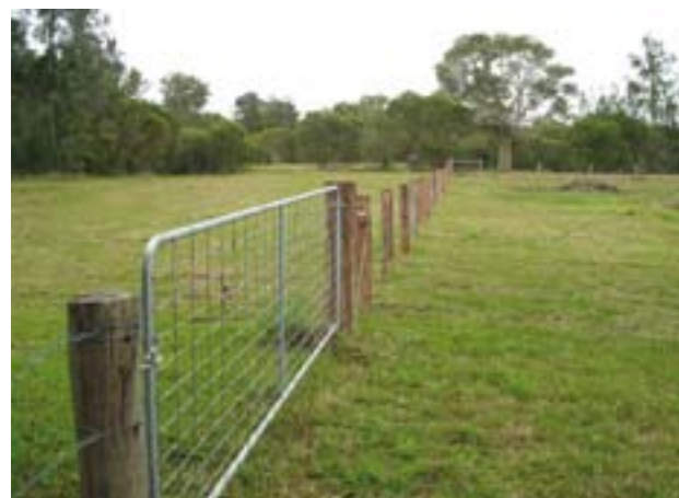
Fencing to restrict stock access to the region’s fragile riparian zone.

The Bungawalbin is a naturally rich and diverse wetland. It is home to some unique Australian wildlife and also provides benefits to its nearby and downstream communities. The benefits derived from these projects will continue to play an important role in creating healthier and more sustainable wetland and river systems throughout the Bungawalbin Catchment. But perhaps the biggest factor for continuing success is that by gaining active community support and increasing the insight and participation of locals in sustainable land use practices, the people who live by the catchment have a real stake in protecting and directing its future. In conjunction with rehabilitation projects, a healthy future for the Bungawalbin and all its inhabitants is on the cards.