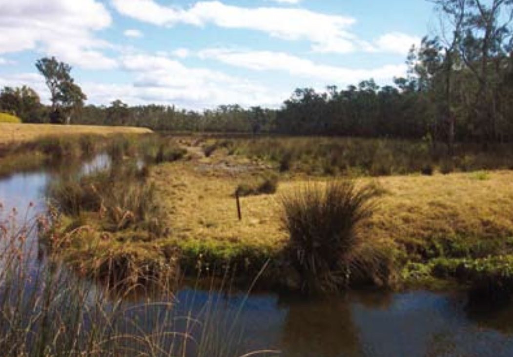
The Broadwater.