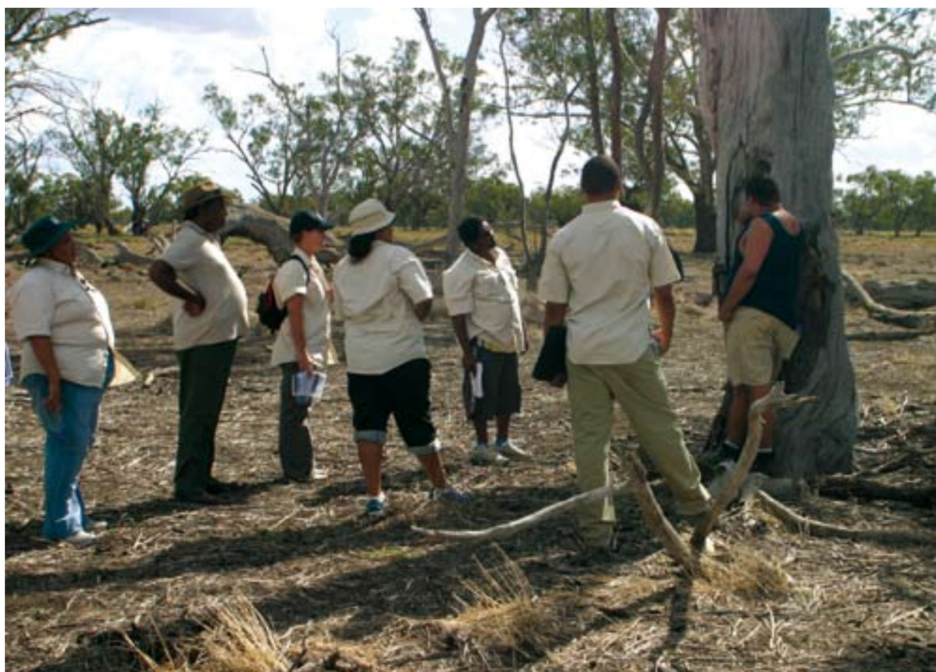
Above: Students learning about cultural site identification at the Macquarie Marshes Nature Reserve.