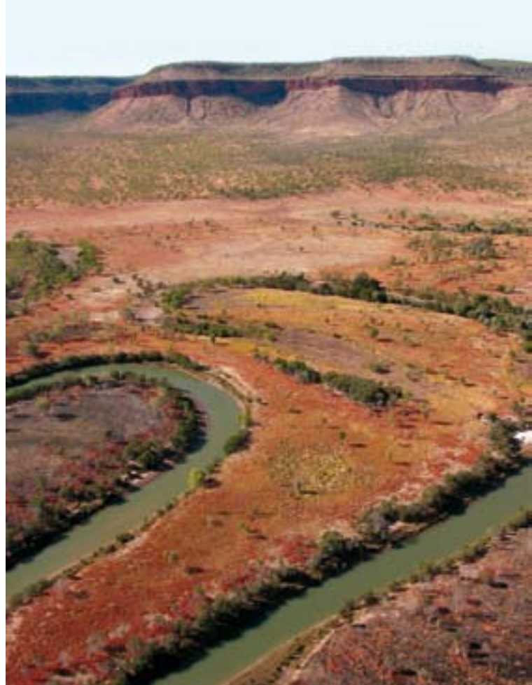
Lalngang Creek, Northern Territory.

Ramsar sites in NSW, plus officials from the NSW Department of Environment and Conservation (DEC), the NSW Department of Natural Resources (DNR), Forestry NSW, the Australian Government, WWF-Australia, and Catchment Management Authorities (CMAs) attended. Both Directors-General from DEC and DNR were also able to attend.