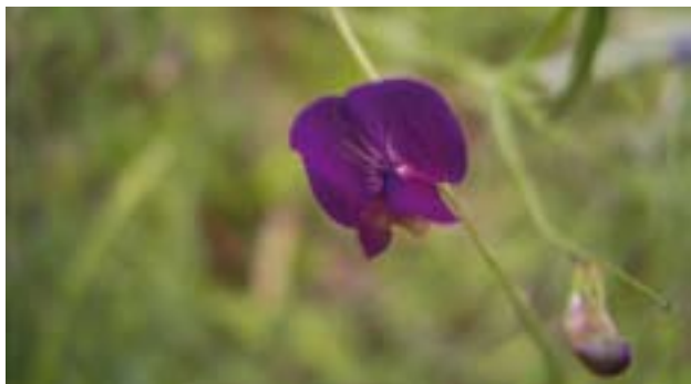
Swamp Darling Pea. Diverse plant associations are a key feature of the forest.