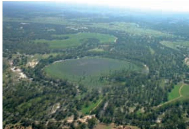
Lake Yelwell and Lake Yerang from the air.