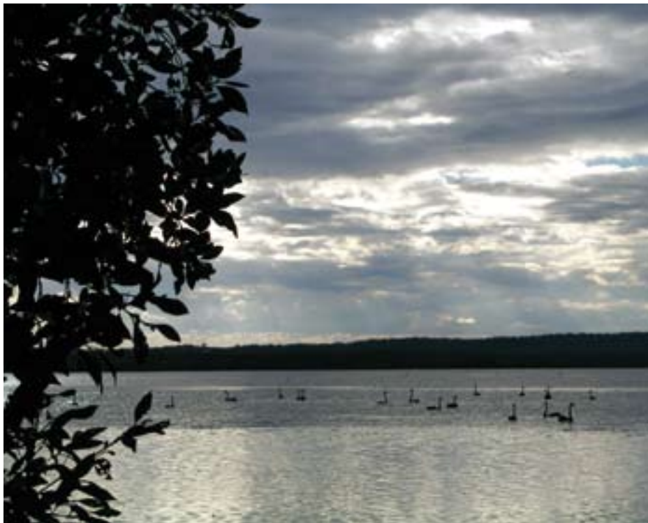
The Broadwater.

The Broadwater provides breeding and nursery grounds for a number of birds (including birds listed under both the Japan-Australia and China-Australia Migratory Bird Agreements (JAMBA and CAMBA); fish (including a wide range of highly valued commercial and recreational species); and invertebrates. The Broadwater is an important location for the Aboriginal community, and has European cultural values closely linked with the history of agricultural settlement and the character of the agricultural landscape.