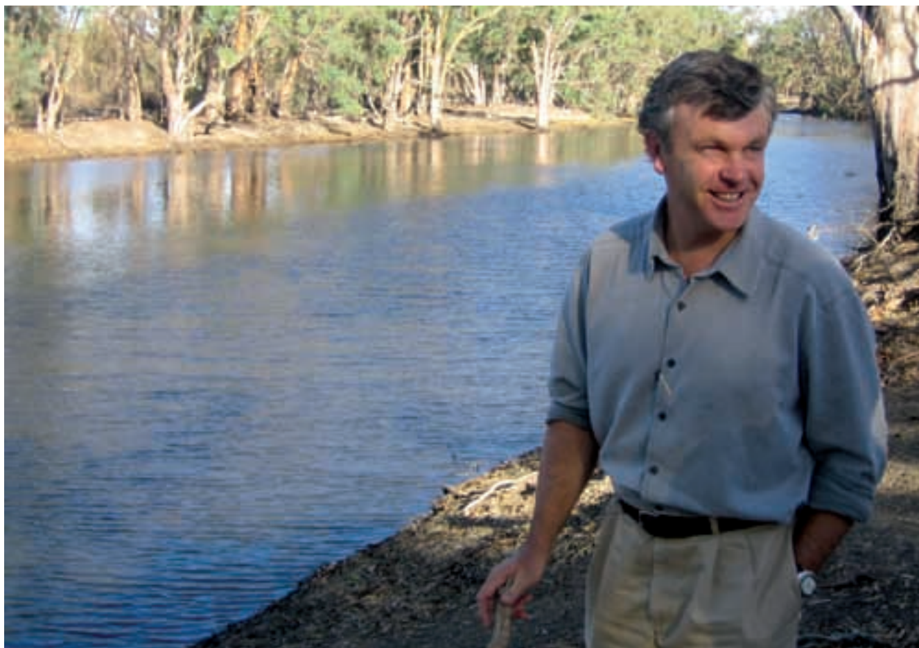
Senator the Hon. Ian Campbell, Australian Government Minister for the Environment and Heritage.

I welcome the article on page 1 on the subantarctic Heard and McDonald Islands, which are being considered by the Antarctic Division of my Department for nomination as Wetlands of International Importance under the Ramsar