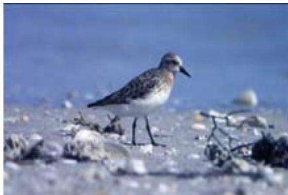
Red-necked Stint.

For further information about the EPBC Act and Migratory species, please visit < www.deh.gov.au/epbc/species/index.html >.