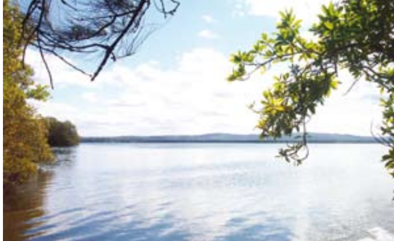
The Broadwater.