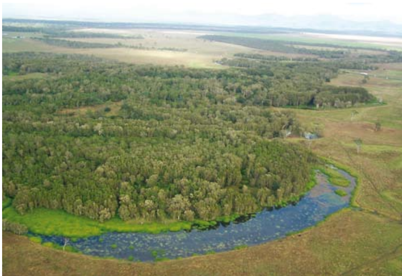
Georganga wetland retains many of its original values but is under threat from aquatic and woody weed invasion as well as feral pig damage.