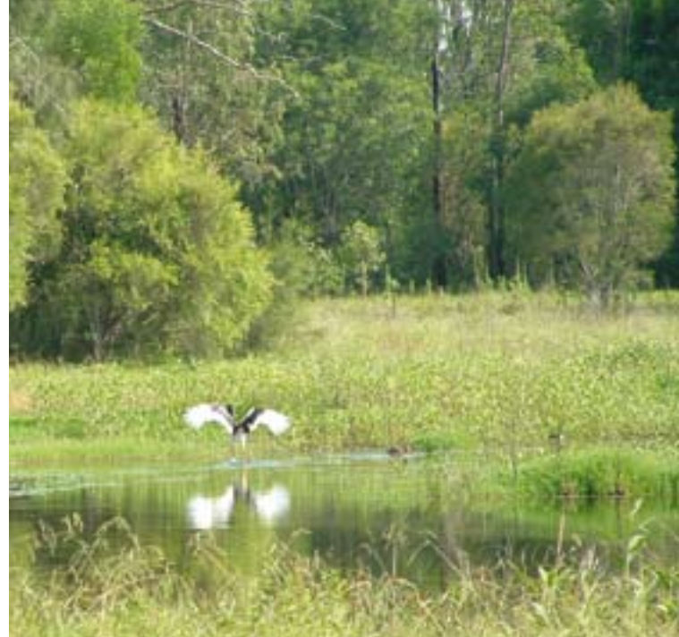
Black-necked Stork

During the project all Black-necked Stork and Comb-crested Jacana sightings, and nest sightings, were mapped. Landholders received information and fact sheets explaining the importance of the two species and their habitat requirements. Site visits and surveys followed involving