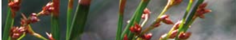
Rush (sedge) Dapsilanthus ramosus .

wetlands within NSW, including the four Private Ramsar Wetland sites; and