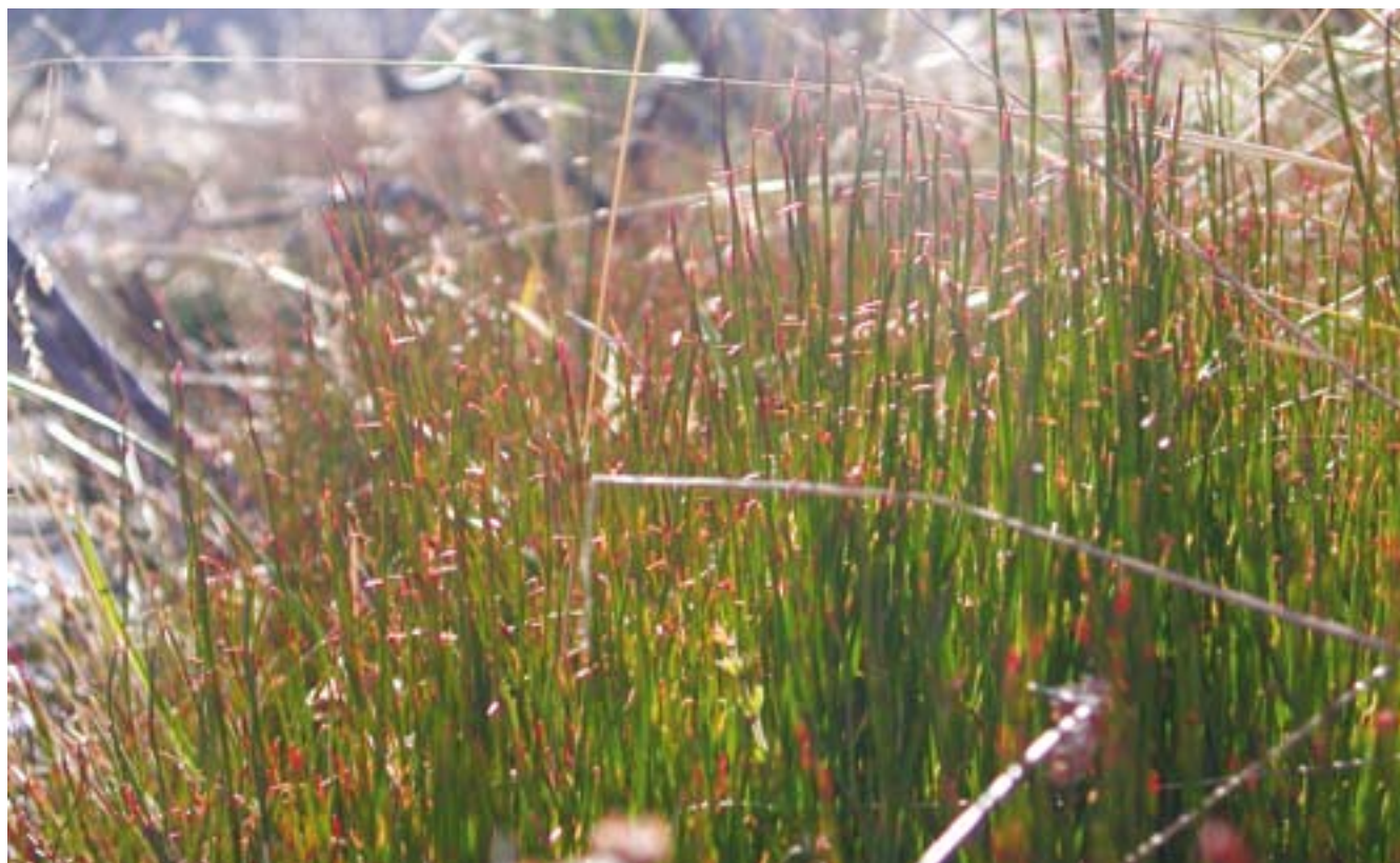
Alpine Bog Wetland.

More information on IWC development and the measures included can be found in the 'Index of Wetland Condition. Conceptual framework and selection of measures' and 'Index of Wetland Condition. Assessment of wetland vegetation' project reports, which are available on the DSE website < http://www.dse.vic.gov.au/dse/index.htm >.