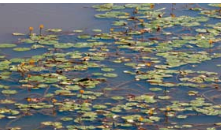
Marshwort Nymphaeoides crenata.