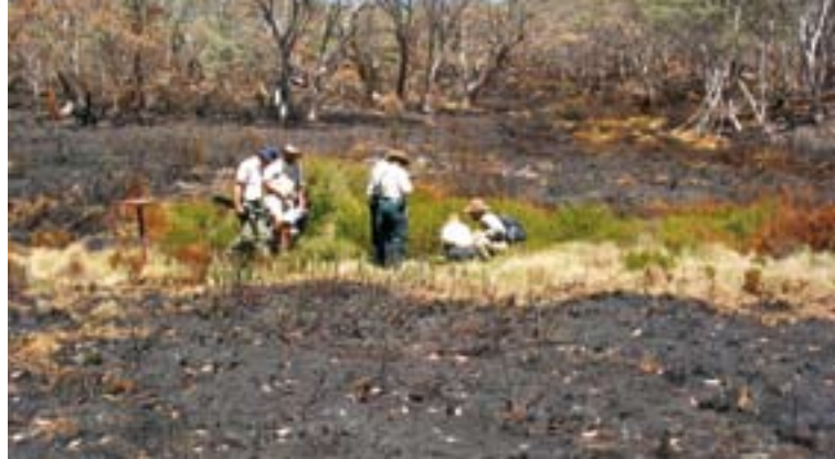
Investigating and assessing one of the burnt bogs.

The Sphagnum Moss Bog Restoration Project is underway in the Namadgi National Park in the ACT and, across the border, in the subalpine areas of the Kosciusko National Park. The subalpine bog sites include Cotter Source Bog, Rotten Swamp and the Ramsar listed Ginini Flats Wetland Complex. Sphagnum moss bog experts from the ACT, NSW and Tasmania are assisting restoration efforts by Environment ACT and the NSW National Parks and Wildlife Service. It's groundbreaking work, much of which has not