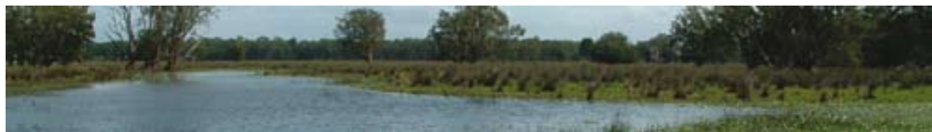
The Bungawalbin Catchment.