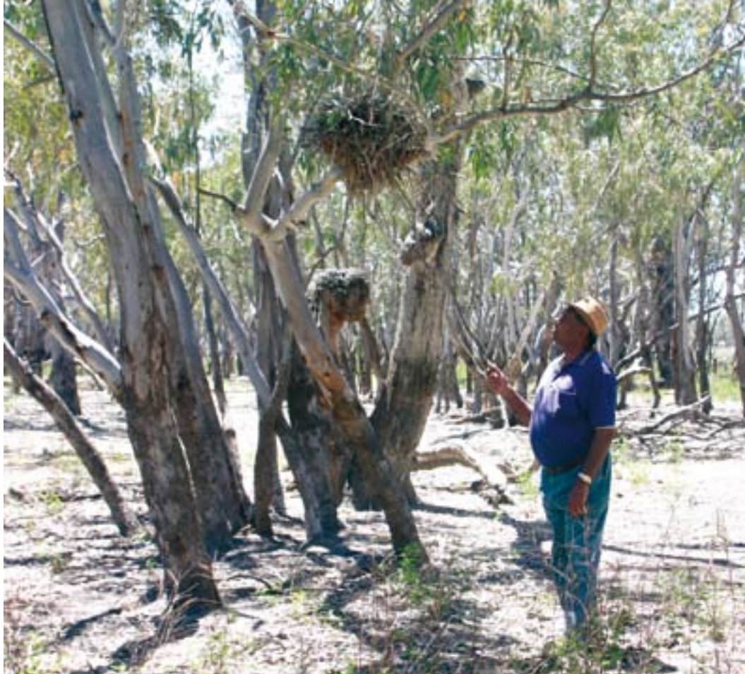
Left: Part of an "ordinary" wetland in central western NSW.

Note: while government agencies can designate a wetland as "Significant" (that is, of State, national and even international importance), many other wetlands are not so rated.