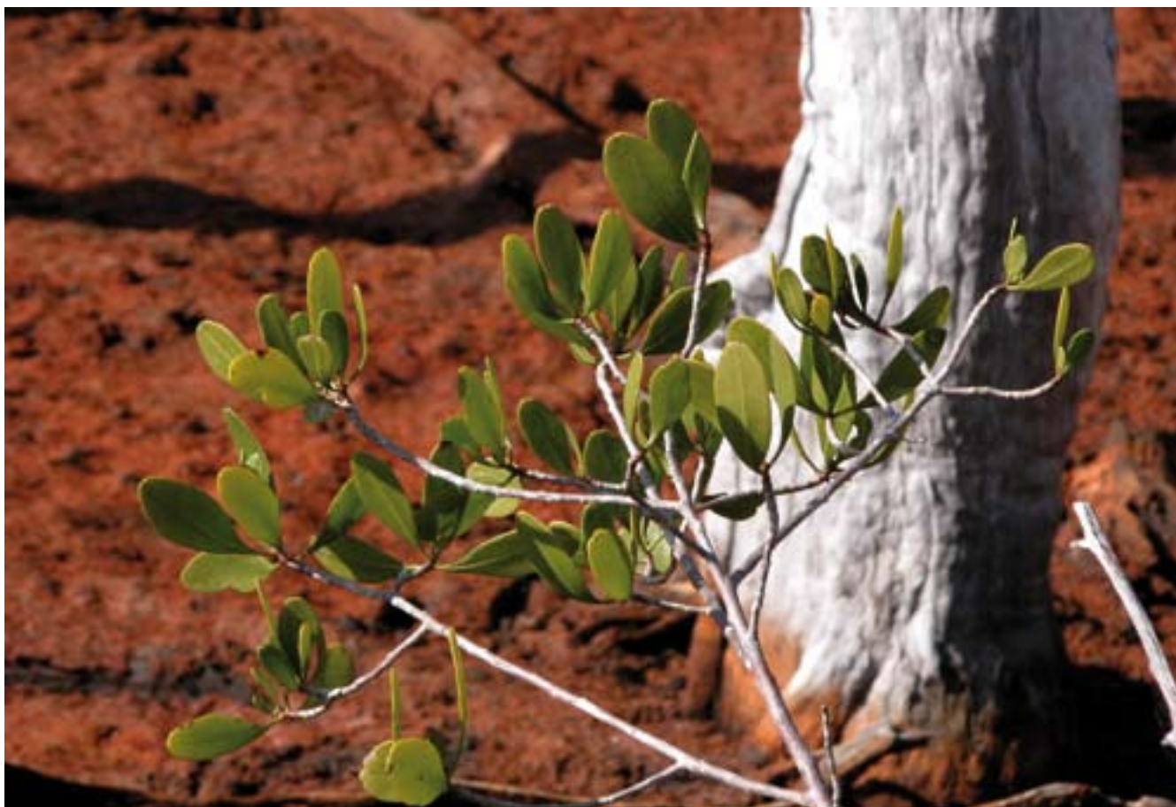
Mangrove, saline flats associated with the Moresby River, QLD.