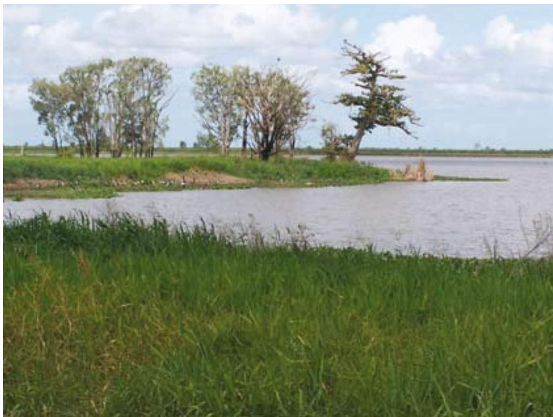
Horseshoe Lagoon suffers from aquatic weed infestation and permanently high water levels from irrigation tailwater.

In particular, the pilot programme will support projects that deliver permanent protective measures such as conservation agreements.