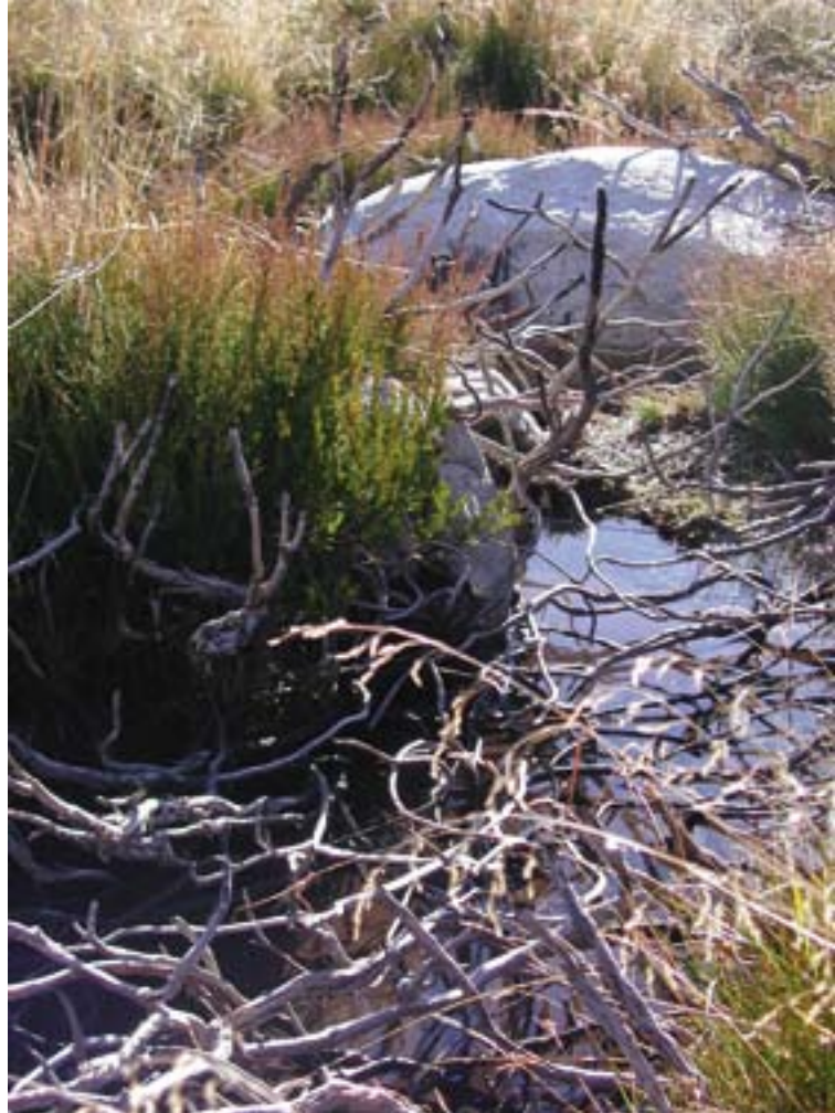
Ginini Flats Wetland Complex, ACT.

An Australian Wetland Inventory is a significant undertaking that will take time to develop and implement, and will need the continued support of all interests to make it viable. It is an important step forward for the conservation and management of wetlands in Australia.