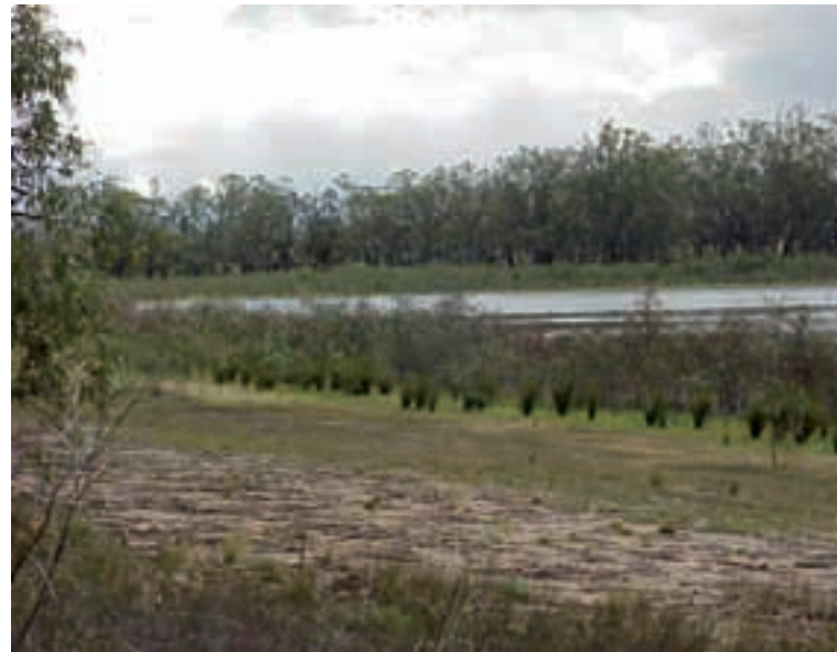
Lake Hattah.

For more information go to < www.malleecma.vic.gov.au/ >.