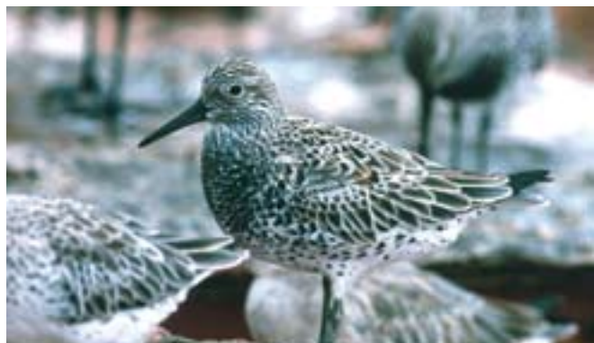
Great Knot.