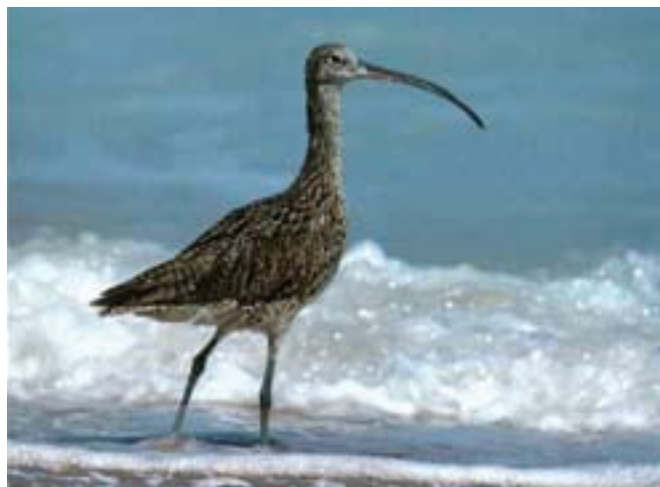
Eastern Curlew.