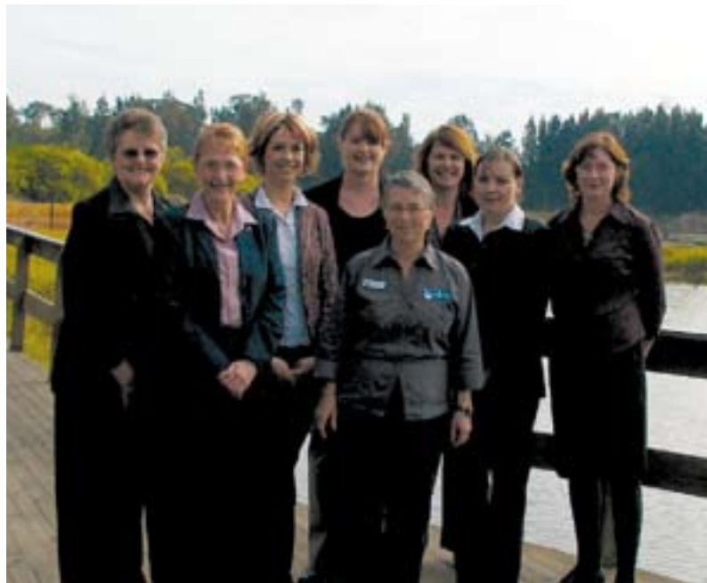
The team at the Hunter Wetlands Centre Australia.

The Hunter Wetland Centre's award belongs to all the people who have been a part of the organisation over the