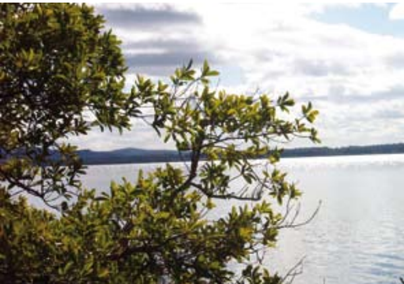
The Broadwater.

The wetland comprises all stages of wetland vegetation succession from the aquatic ecosystem to the adjacent terrestrial vegetation. It contains sub-tidal aquatic beds (seagrasses, marine meadows such as water couch and open water systems); estuarine waters; inter-tidal mud, sand and salt flats; inter-tidal forested wetlands (mangrove swamps); freshwater lagoons and marshes within the coastal zone (swamp forests—spike and pin rush swamps and water couch meadows); and non-tidal freshwater forested wetlands.