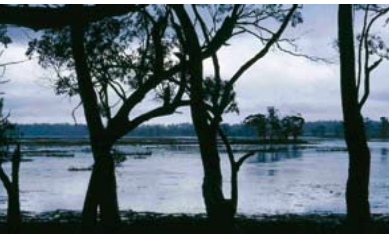
Interlaken wetland, part of the larger Lake Crescent, located in the Northern Midlands of Tasmania, near Tunbridge. The wetland includes marshflats and several rare plant species, and is an important refuge for ducks, especially during drought.

Email: <danielle.hardie@dpiwe.tas.gov.au>