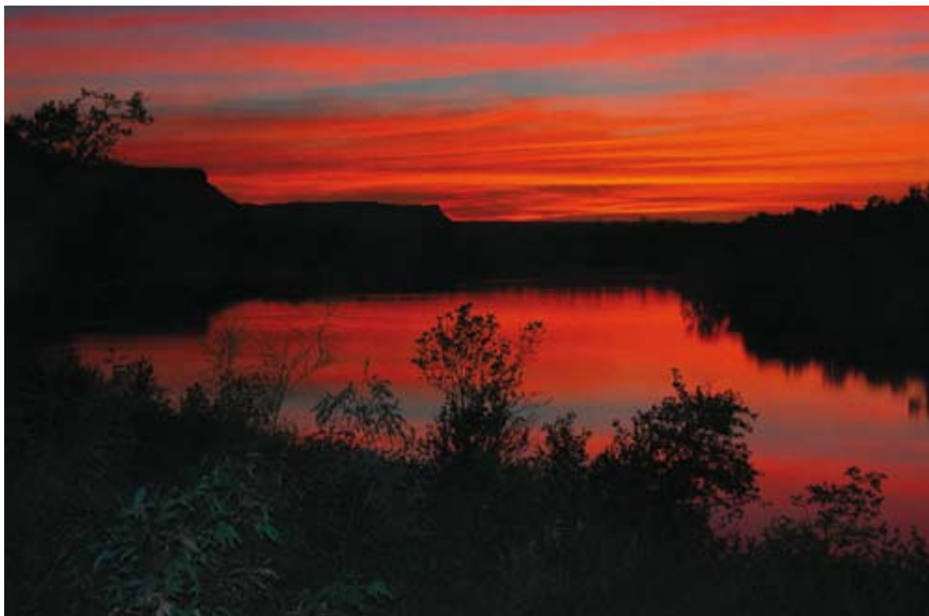
Angalarri River, Northern Territory.