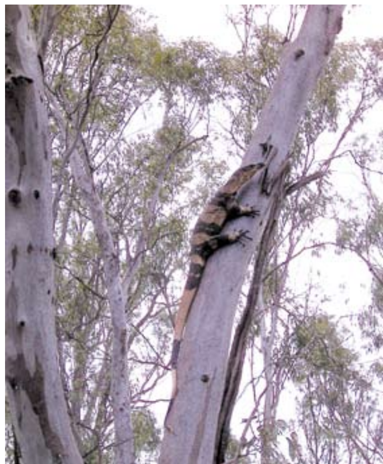
Goanna. The Barmah-Millewa Forest provides breeding habitat for a number of species including fish, frogs and reptiles.

The Living Murray is an initiative of the Murray-Darling Basin Commission and is a partnership of the Australian, NSW, Queensland, Victorian, SA and ACT Governments.