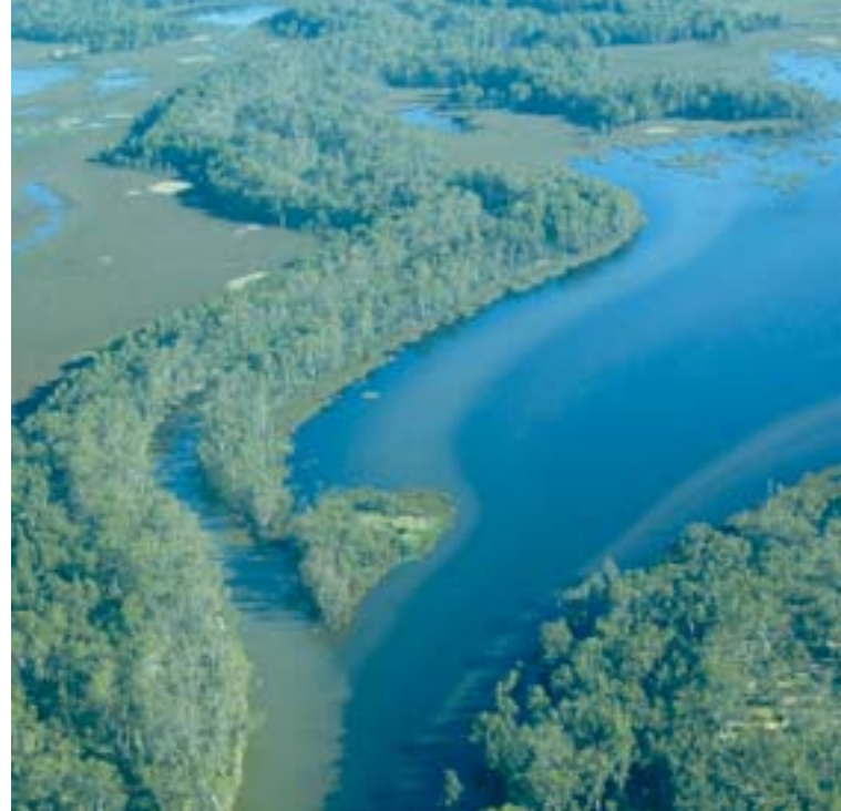
Low level flooding of Barmah (Vic) and Moira Lakes (NSW)—4 November 2005.

Each asset has an Asset Environmental Management Plan (AEMP) that explores the ecological objectives for the asset and identifies the volume and timing of environmental water and structural works needed to achieve those objectives.