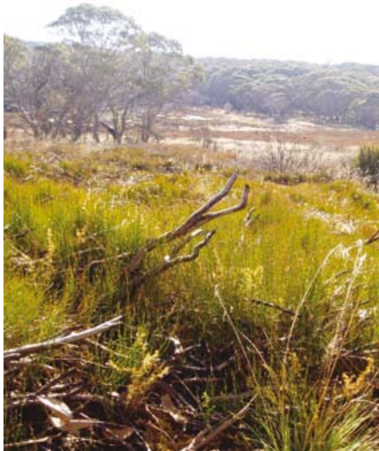
Alpine Bog Wetland.

The Index has national relevance. Across Australia, NAP and NHT require natural resource managers to determine how appropriate, effective, and efficient national policies, strategies and programs are in improving water quality, addressing salinity, and repairing the natural environment. This involves monitoring natural assets and evaluating management responses. Aquatic ecosystems, particularly wetlands, are nationally recognised natural assets. In Victoria, a standard method for assessing wetland condition was needed to help natural resource managers address NAP and NHT monitoring and evaluation requirements for wetlands