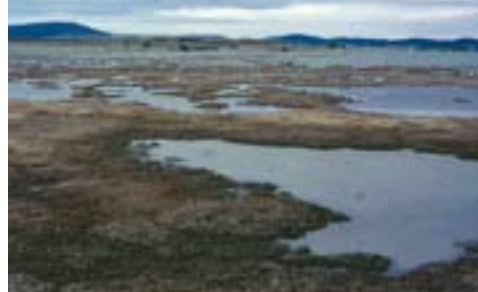
Orielton Lagoon, located in SE Tasmania approx. 20km east of Hobart. It is an estuarine wetland of global importance, as an important summer feeding ground for a range of migratory birds.

The Natural Heritage Trust (NHT) has funded a much-needed update of the Tasmanian section of DIWA. In 2000, the National Land and Water Resources Audit identified another nearly 300 wetlands for assessment and possible listing on the DIWA. This project will capitalise on the new CFEV database to provide a comprehensive update of the Tasmanian DIWA listings, greatly improving local knowledge of the number and indicative condition of significant wetlands in the state.