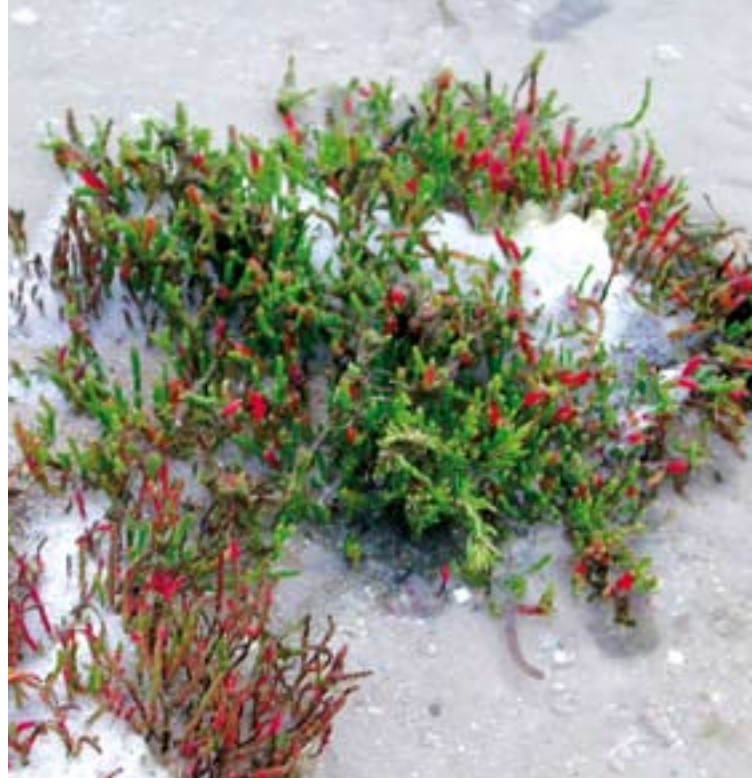
Samphire, Coorong, South Australia.