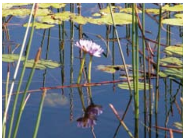
Nymphaea waterlily among Eleocharis spike-rush.

Taskforce discussions have developed a vision for the national inventory, identified a range of potential uses, articulated its principles and a preferred option for data structures, and considered ideas about potential delivery mechanisms for the AWI.