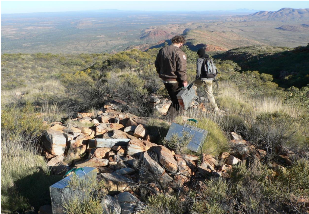
Figure 2. An example of core refuge habitat for the central rock-rat on Mt Sonder, West MacDonnell National Park, August 2010. This population may now be extinct as rock-rats were last detected here in June 2012.