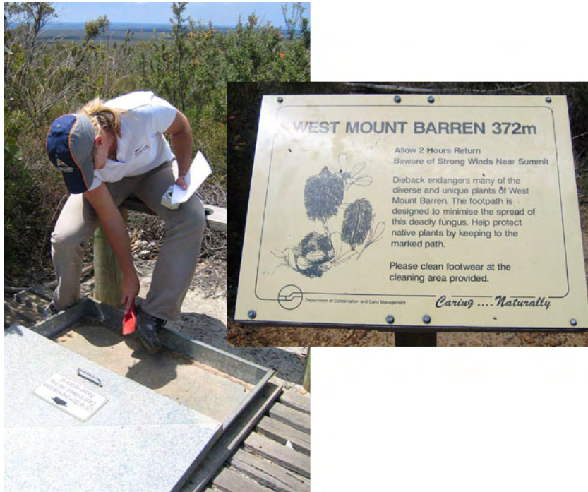
Figure 3.7.7 A boot cleaning station in Fitzgerald River National Park in the south-west of Western Australia, consisting of: a metal pan and lid into which soil is brushed from footwear with the brush provided, brief instructions (on the lid) and a plea to bushwalkers for cooperation.