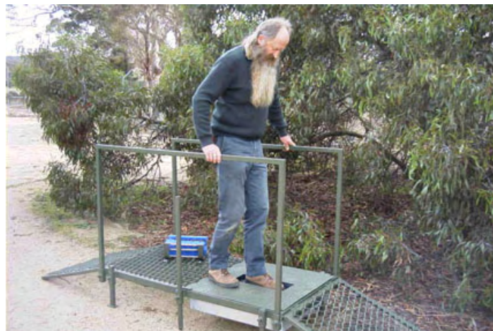
Figure 3.7.8 The ‘Anakie Scrubber’ footwear cleaning station consists of a metal ramp and disinfectant bath with an immersion plate for the cleaning of footwear prior entering uninfested areas to protect from the introduction Phytophthora cinnamomi (Photo courtesy of D Peters, Parks Victoria).

Since the early 1990s phosphite (also referred to as phosphonate), the anionic form of phosphonic acid ( \text{HPO}_3^{2-} ) has been successfully used in WA to reduce the impact of P. cinnamomi in natural ecosystems (Hardy et al. , 2001). The main focus of phosphite use by CALM is the protection of critically endangered flora species. Phosphite is currently being used in WA to maintain highly susceptible and critically endangered Banksia brownii , where the only remaining populations occur on sites already infested by the pathogen (Barrett et al. , 2003). It is also being used in an integrated management program to contain the spread of P. cinnamomi from a localised infestation in Fitzgerald River National Park, which is renowned for its rich biodiversity and high numbers of rare and endangered flora and fauna species.