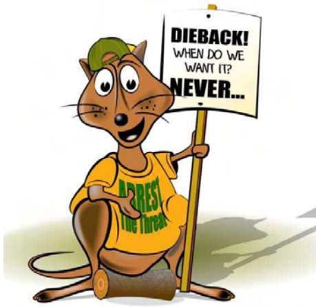
Figure 3.1 Gilbert the potoroo, developed by the West Australian Dieback Working Group to promote awareness about Phytophthora cinnamomi and its impacts in the South-West of Western Australia.

The communications strategy in WA also plans to make use of the more traditional forms of electronic media of radio and television through community announcements, and informative segments on relevant local gardening and environmental programs. A segment on Phytophthora diseases in gardens appeared in May, 2005 on the Australian Broadcasting Commission's national Gardening Australia program featuring the CPSM and the WA DWG.