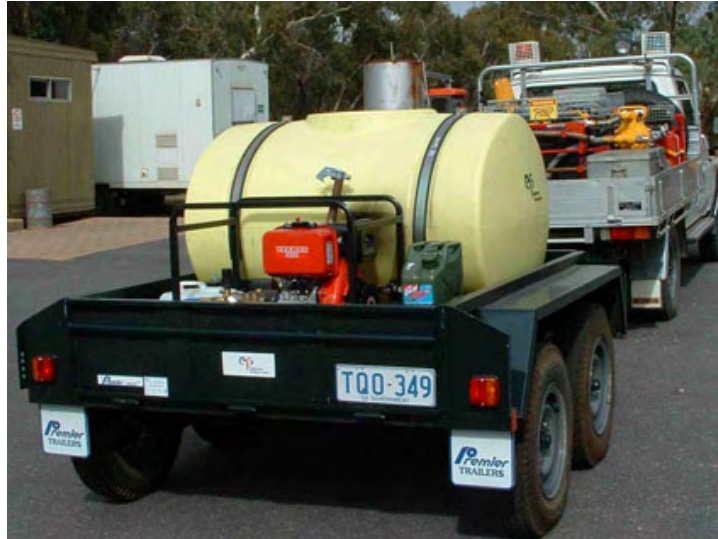
Figure 3.7.4 A portable wash-down unit. This type of system is used widely in South Australia and Western Australia to wash vehicles and equipment during general field and fire-fighting operations (Photo courtesy of R Velzeboer, Department for Environment and Heritage in South Australia).

Hygiene measures commonly call for the minimisation of water during cleaning, as wash-down effluent also poses a risk of spreading the pathogen. To reduce the amount of water required for effective wash-down it is recommended that large clods of dirt are firstly removed with a hard brush or other tool (DWG, 2000; PTG, 2003; Worboys and Gadek, 2004). Dust and grime need not be removed (DWG, 2000; CALM, 2003; PTG, 2003).