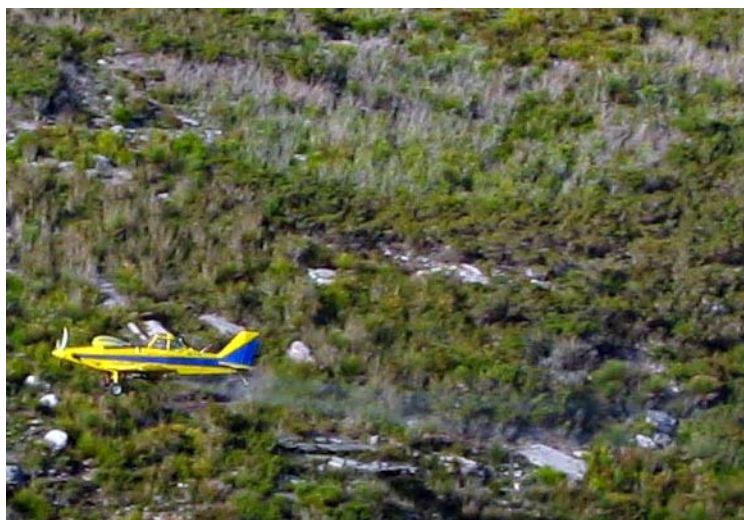
Figure 3.7.10 Aerial application of phosphite in Stirling Ranges National Park in the south-west of Western Australia (Photo courtesy of G Freebury, Department of Conservation and Land Management, Western Australia).

Conserving flora in-situ is one of the most important objectives of CALM in WA, however, with no definitive or quick solution to the threat of P. cinnamomi , ex-situ conservation may be the last hope in conserving some of the States susceptible flora (Cochrane, 2001). In WA, ex-situ conservation of germplasm in seed banks is a well established technique (Anon, 2004; Cochrane, 2001; Cochrane, 2004). Although flora can be conserved as pollen, tissue/cell culture, DNA or living plants, the conservation of seed has many benefits: as it only requires simple technology, costs and pace requirements are relatively low, most flowering plants produce seeds which can be stored for long periods with little loss of viability, the technique is applicable over a wide range of species, and there is wider genetic representation in seed than in vegetative material (Cochrane, 2004).