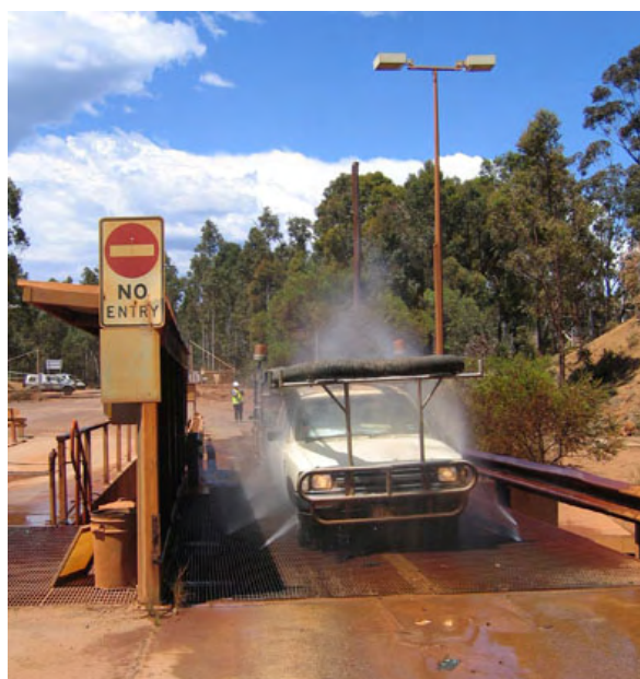
Figure 3.7.3 The automatic wash-down facility at the entrance to Alcoa's Huntly bauxite mine in the south-west of Western Australia, designed to remove soil from trucks and light vehicles entering the mine, thus minimising the probability of introducing Phytophthora cinnamomi to the predominantly disease-free site.

Where wash-down facilities are not provided, 'clean on entry' requires a sense of responsibility, and good organisation by individuals. Many of the hygiene measures are based on the principle that 'it is easier to keep clean than to get clean', leading to three key recommendations: i) postpone activities during wet weather, ii) begin activities with clean vehicles/equipment, and iii) avoid wet or muddy areas during activities.