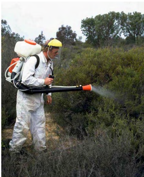
Figure 3.7.9 Foliar application of phosphite by backpack mister (Photo courtesy of B Shearer, Department of Conservation and Land Management, Western Australia).

Aerial application (Figure 3.7.9) is a rapid way to treat entire plant communities especially where rough terrain would make ground application prohibitively expensive (CALM website – Dieback Phosphite, accessed 11/04/05). Foliar application using backpack (Figure 3.7.10) or trailer-mounted sprayers is usually restricted to small areas such as small reserves, small areas of remnant bushland or spot infestations (Hardy et al. , 2001). Trunk injection of trees and large shrubs is used in strategic areas where their loss would have a high visible impact, and where foliar application is impractical (Hardy et al. , 2001).