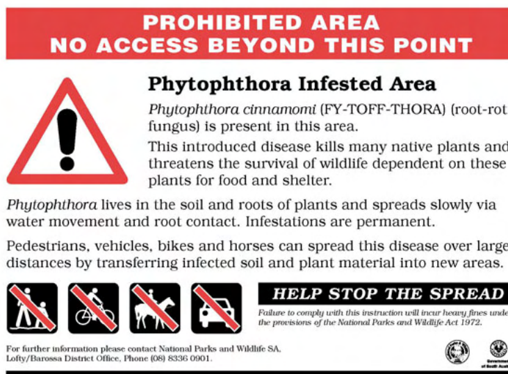
Figure 3.7.1 A sign used by the Department for Environment and Heritage in South Australia to inform that all access is restricted to a Phytophthora infested area, with the aim of minimising pathogen spread, and that non-compliance is an offence that can attract a fine (Image courtesy of R Velzeboer, Department for Environment & Heritage in South Australia).

When access to an area is to be permanently prohibited, the methods of road closure must ensure that unauthorised use cannot continue. The methods and standards of permanently closing and rehabilitating roads recommended by CALM include, mechanical ripping of a portion of the road/track surface and/or the use of logs (>400mm diameter) and other debris to block the entrance (Figure 3.7.2) (CALM, 2003). Other structural barriers such as gates and fencing are used to restrict pedestrian and vehicle access. Non-structural barriers such as signs, bunting and flagging tape, paint 'blazes' on trees, pegs and cones (Alcoa Procedural Control Documents; CALM, 2001) are used during mining and forestry operations in WA to demarcate disease boundaries, and to trigger access and hygiene procedures by staff and contractors.