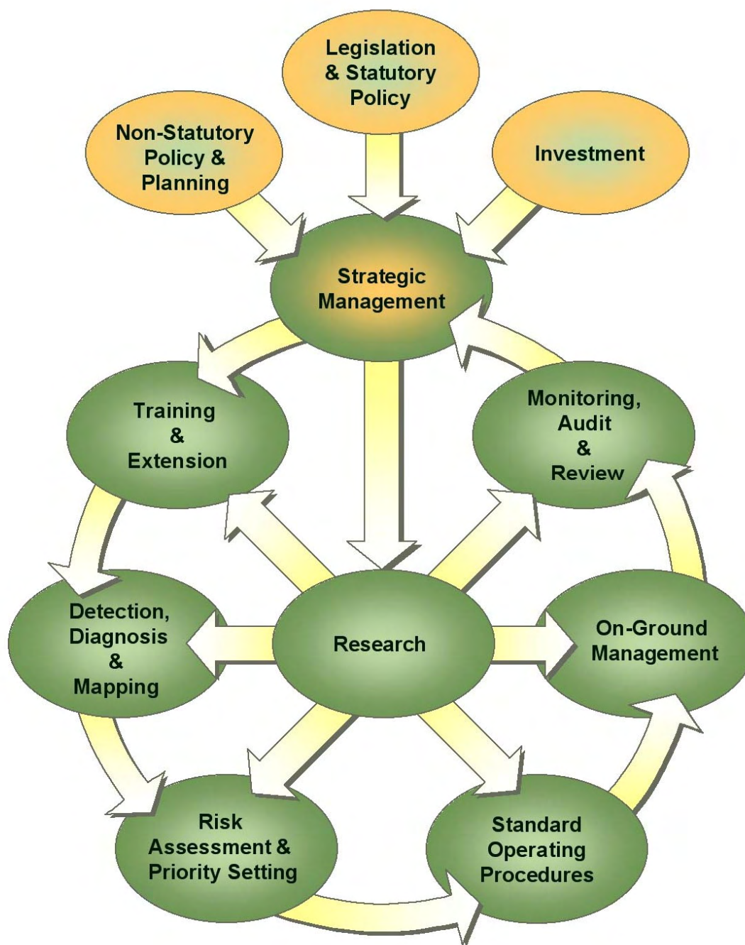
Figure 2.1 A best practice model for the management of Phytophthora cinnamomi for biodiversity conservation in natural ecosystems of Australia.