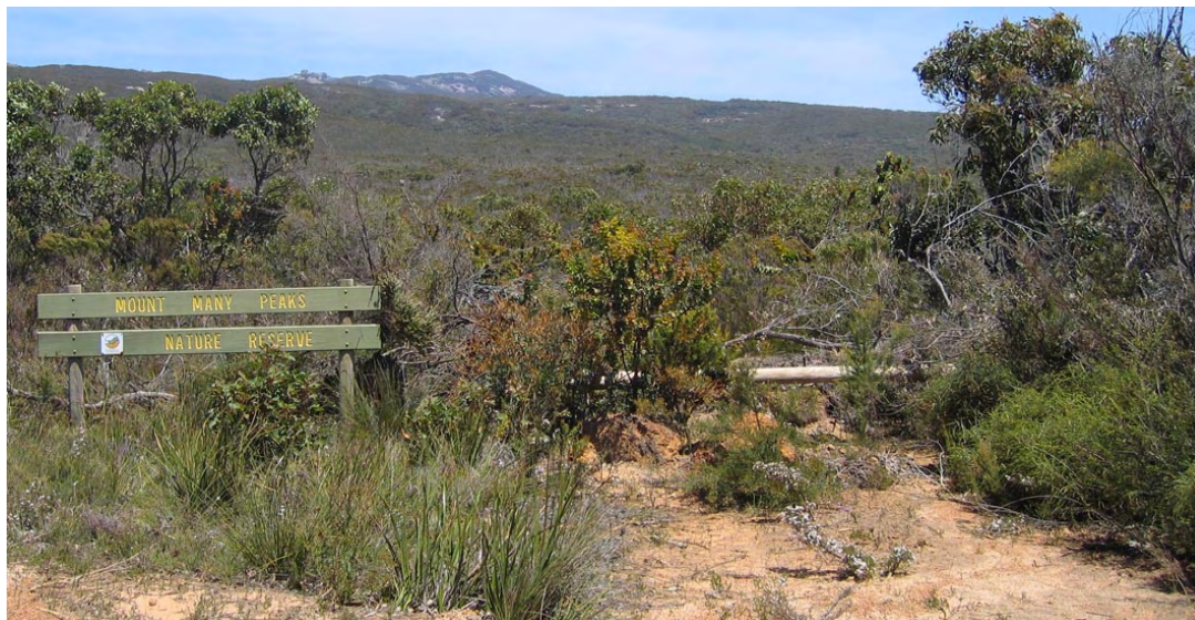
Figure 3.7.2 Permanent closure of a track in Waychinicup National Park in the south-west of Western Australia, by mechanical ripping of a portion of the track, and blocking of the entrance with a log and debris.

area can be considered a form of 'hygiene'. However, hygiene also refers to specific procedures designed to prevent the dissemination of P. cinnamomi by ensuring that infested soil, water and/or plant material are removed from machinery, vehicles, equipment and footwear before they enter uninfested areas.