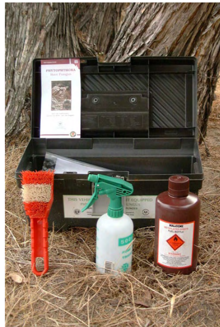
Figure 3.7.6 A 'hygiene kit' containing equipment and information to facilitate the cleaning and disinfection of footwear, small tools and equipment against Phytophthora . The Department for Environment and Heritage in South Australia actively and widely promote the assembly and use of such kits.

In situ apparatus for footwear hygiene ranges in sophistication from a simple tray and brush system (Figure 3.7.7) to a system developed by Parks Victoria nicknamed the 'Anakie Scrubber' (Figure 3.7.8). The footwear bath of the Anakie Scrubber, which contains disinfectant, is designed to minimise evaporation, prevent the entry of rainfall and animal access. This equipment will require less maintenance by Park staff (D Peters, pers. comm. ).