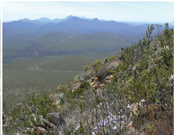
Photos: (left) Wildflowers on Mondurup Peak, Stirling Range before Phytophthora dieback, (right) Mondurup Peak, Stirling Range after Phytophthora dieback