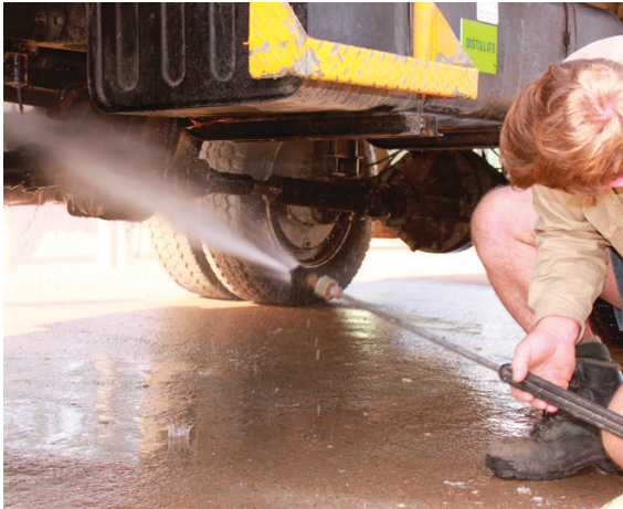
Photo: Truck undercarriage wash-down