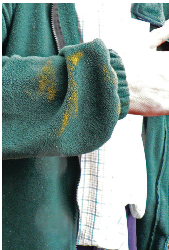
Photo: Myrtle rust spores on clothing after chance contact with an infected shrub