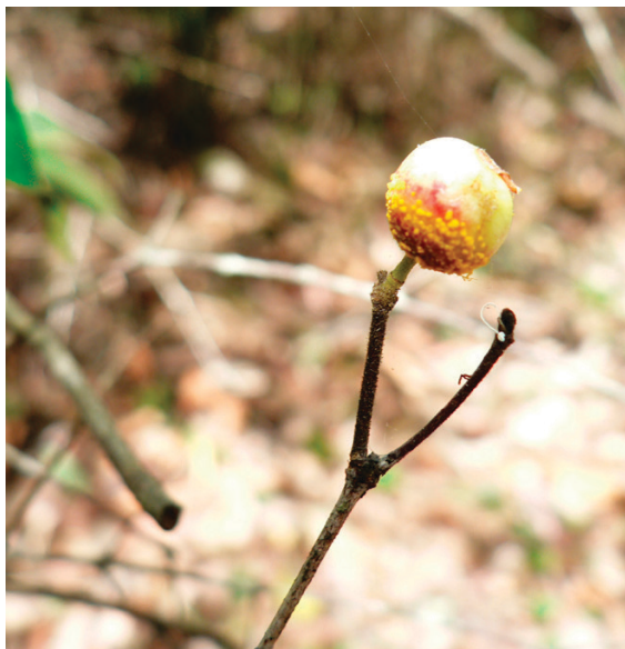
Photo: Myrtle rust pustules on scrub turpentine ( Rhodamnia rubescens ) fruit

Knowledge of the impacts of myrtle rust on Australian biodiversity is still limited. Myrtle rust infection may cause significant mortality among younger plants and therefore reduce the number of plants capable of maturing and reproducing. This may contribute to the decline of species, including threatened species, leading to potential impacts on the structure and function of ecosystems dependent on Myrtaceae. At the time of writing, nearly 350 native species are known to be susceptible to myrtle rust infection, some severely. The host list (see References and resources below) is expected to grow. However, all Myrtaceae are potentially susceptible and potential hosts for the disease.