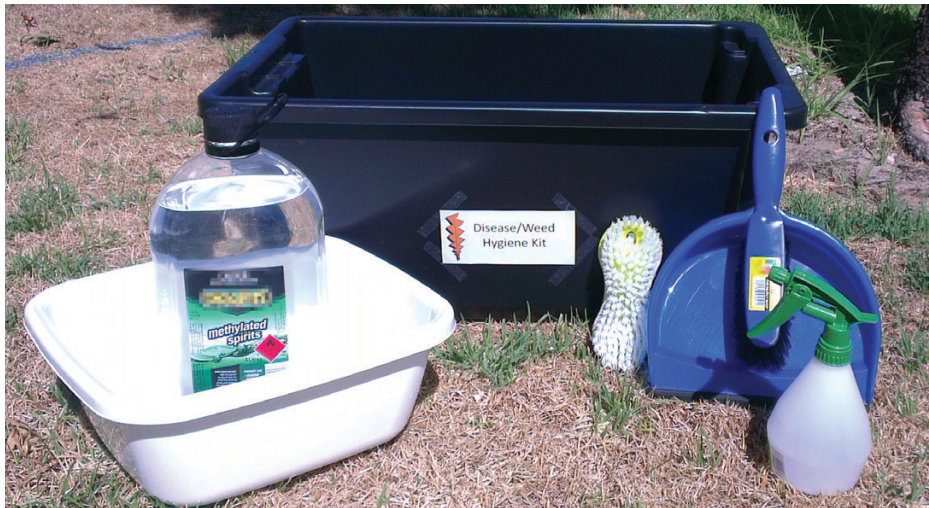
Photo: Biosecurity hygiene kit