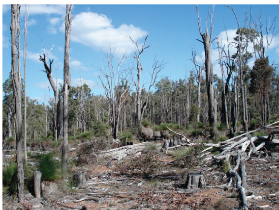
Photo: Impact of Phytophthora cinnamomi at Dwellingup, WA (Department of Parks and Wildlife WA)

Under favourable conditions Phytophthora spp. can spread easily and quickly, destroying plants and plant communities. These guidelines to help minimise the risk of spreading Phytophthora cinnamomi also apply to other species of Phytophthora present in Australia, as the management of those species is similar.