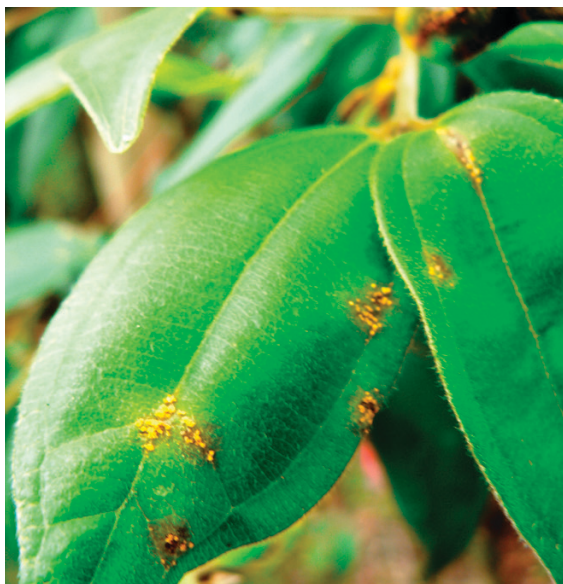
Photo: Myrtle rust pustules on scrub turpentine ( Rhodamnia rubescens ) leaves (R.O. Makinson)