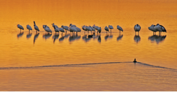
Images: Roebuck Bay Wetlands – BruceGray, Green Turtle – ©GBRMPA, Black Swans – BrianFurby, Jocks Lagoon Wetlands – Michelle McAulay, Azure Kingfisher – Wet Tropics Management Authority Queensland, Southern Corroboree Frog ©Steve Wilson, Royal Spoonbills – Paul Wainwright, Kununurra Wetlands Flood Plain – Angus MacGregor

The Australian Government and state and territory governments have laws to protect water, native species and significant wetlands. Local government planning controls can also protect local wetlands. Catchment and conservation groups and natural resource groups help restore and maintain local wetlands. Landholders, farmers and land managers contribute to the wise use of wetlands. Local wetland education centres highlight the value of wetlands and encourage visitors to enjoy the recreational benefits of wetlands. Many tourism operators promote wetlands to local and overseas visitors.