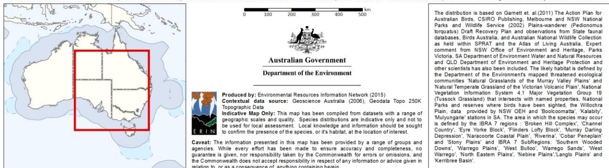
Figure 2: Modelled distribution of the plains-wanderer ( Pedionomus torquatus )

INDICATIVE MAP ONLY: For the latest departmental information, please refer to the Protected Matters Search Tool and the Species Profiles & Threats Database at http://www.environment.gov.au/biodiversity/threatened/index.html