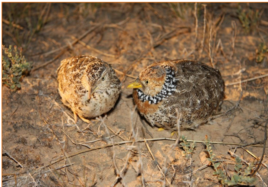
Figure 1: Plains-wanderer male (left) and female (right) in sparse grassland habitat.