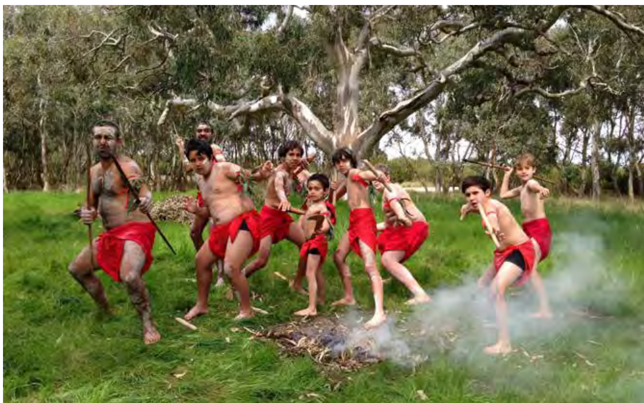
The Gippsland Lakes are culturally significant to the Gunaikurnai people

The Ramsar Convention encourages the integration of the socio-economic and cultural-spiritual values of wetlands, as well as traditional knowledge, in the wise use and management of wetlands.