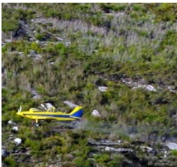
Figure 3 Aerial application of phosphite in Stirling Ranges National Park in the south-west of Western Australia