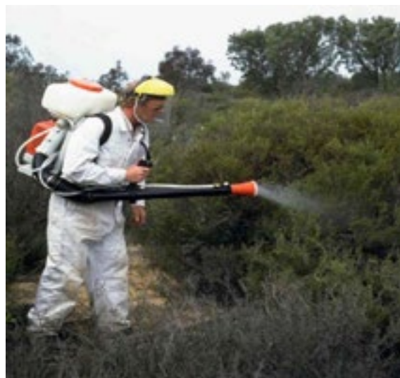
Figure 4 Foliar application of phosphite by backpack mister