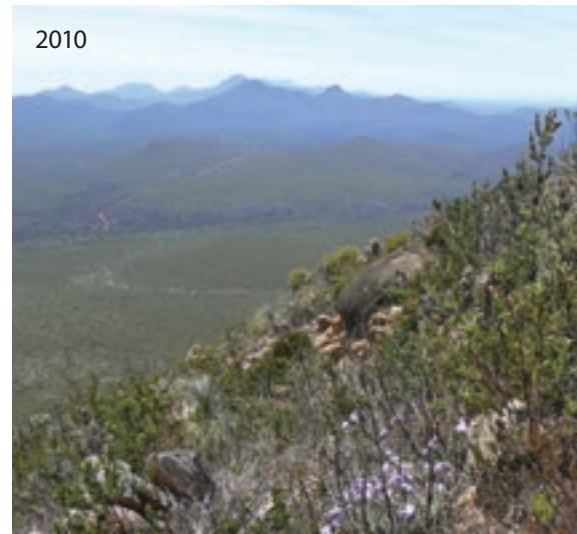
Damaged: These before-and-after images of Mondurup Peak, Stirling Range in Western Australia reveal the effects of P. cinnamomi on the landscape.

A list of over 1000 native plant species known to be susceptible to disease by P. cinnamomi in Australia is contained in the National Best Practice Guidelines (O’Gara et al., 2005b). The list has been compiled from published material, unpublished records and observations of individual researchers.