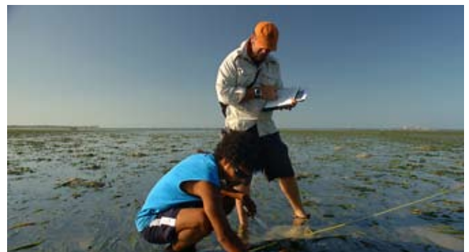
Seagrass-Watch volunteers in Nhulunbuy, Northern Territory.