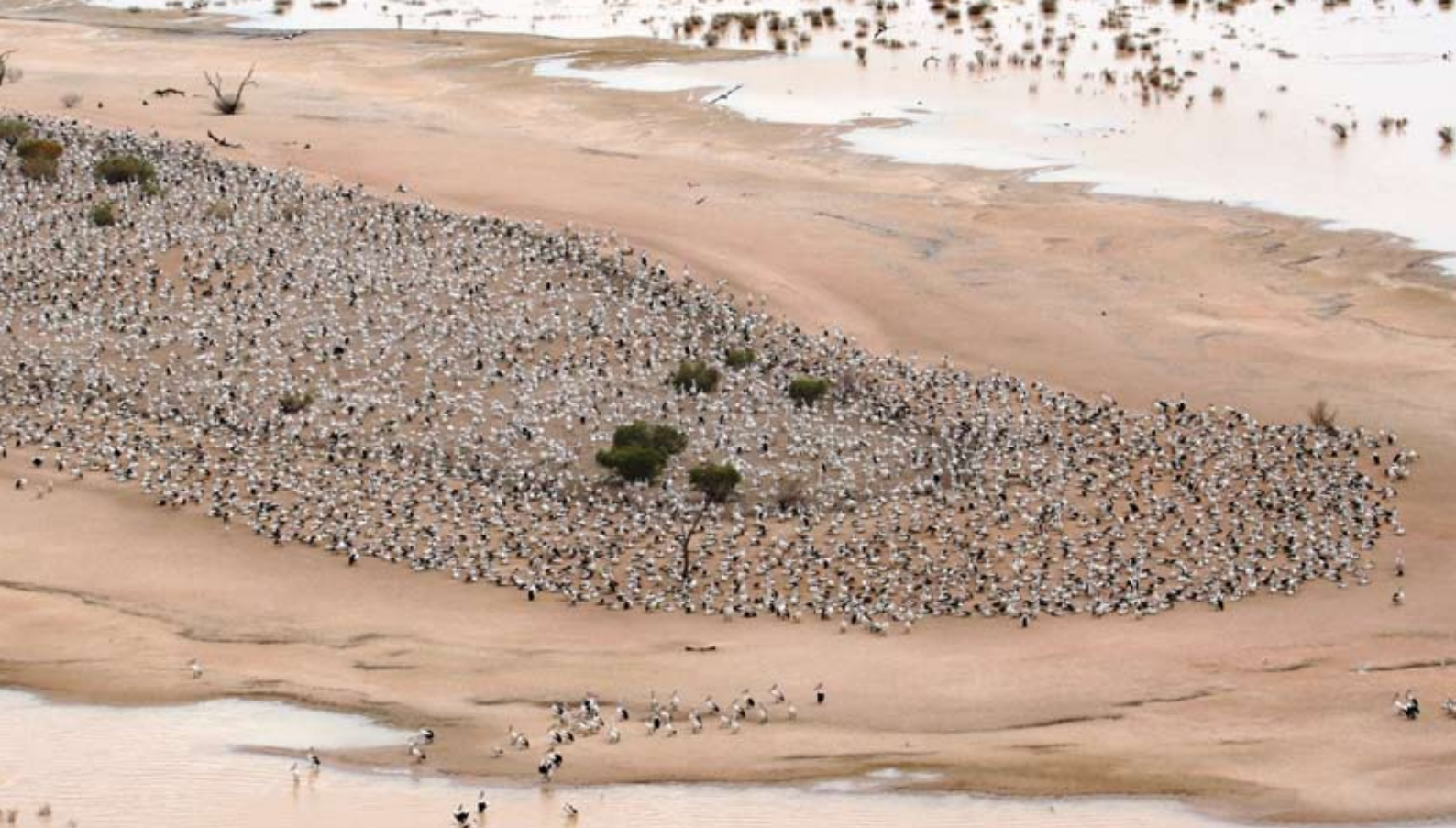
An extensive survey of the rivers of the Lake Eyre Basin covered 1500 kilometres of river systems and revealed the importance of the region for waterbirds.