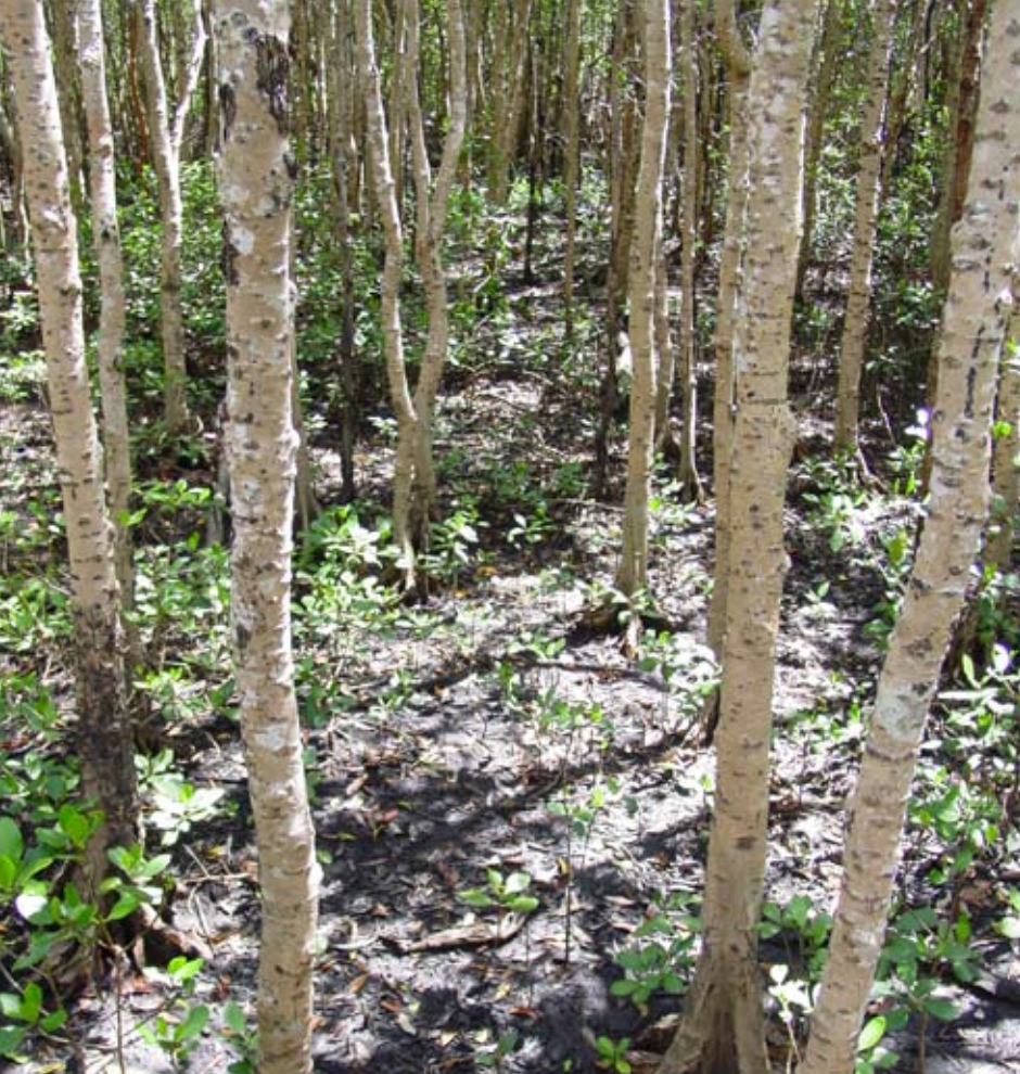
Mangroves and saltmarshes are amongst the most endangered marine wetland habitats worldwide. Above: Yellow mangroves near Cairns.