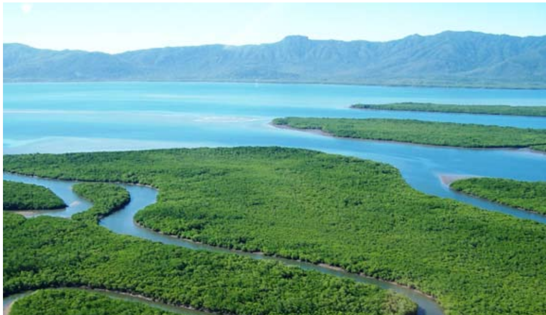
Queensland's declared Fish Habitat Area Network, now 40 years old, includes Hinchinbrook Channel.