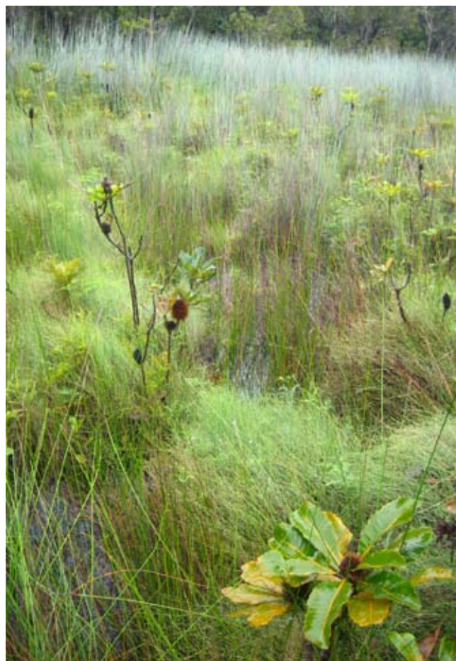
Coastal non-floodplain heath swamp on Fraser Island.

The classification system is now being used in New South Wales and South Australia, demonstrating that it can be applied at different levels of resolution and can be adapted for use at any scale depending on the attribute information available.