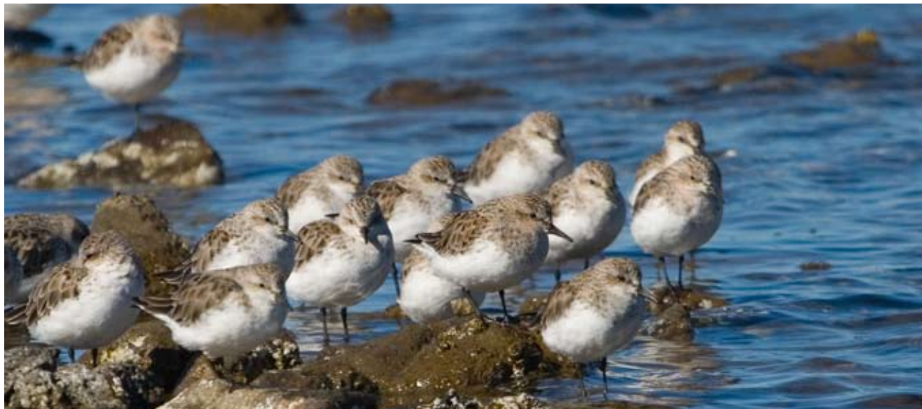
Migratory waders, red-necked stilts, at Tasmania's Pitt Water-Orielton Lagoon.