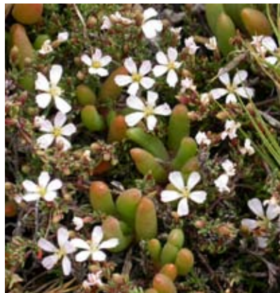
Frankenia pauciflora in flower.

The project also aims to map the distribution of mangroves and the various types of coastal saltmarsh at a scale of 1:10 000 and undertake extensive ground-truthing to confirm the aerial photographic interpretation, and map the likely pre-European and likely post-climate-change (2050) distributions. Social-marketing studies will also be carried out to better understand the attitude of the public