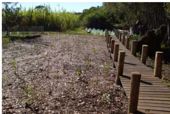
A boardwalk constructed during the regeneration of the Indigenous-owned Cabbage Tree Island wetlands, New South Wales.

The area surrounding the boardwalk was revegetated with more than 6000 local vegetation species, with an emphasis on culturally-significant plants for bush tucker or traditional medicine. The revegetation and boardwalk now connect the