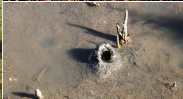
Clockwise: Saltmarsh in the Clarence River estuary, New South Wales, beaded glasswort, mudflat crab hole.