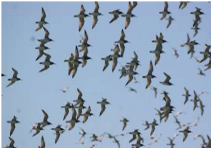
Flock of great knots in flight.