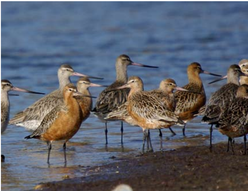
Resident shorebirds of Tasmania's Pitt Water-Orielton Lagoon, bar-tailed godwits.

The need for ongoing strategic planning and management across land tenures is vital for the future conservation and management of this important Ramsar wetland and coastal ecosystem, particularly in this time of major climate change.