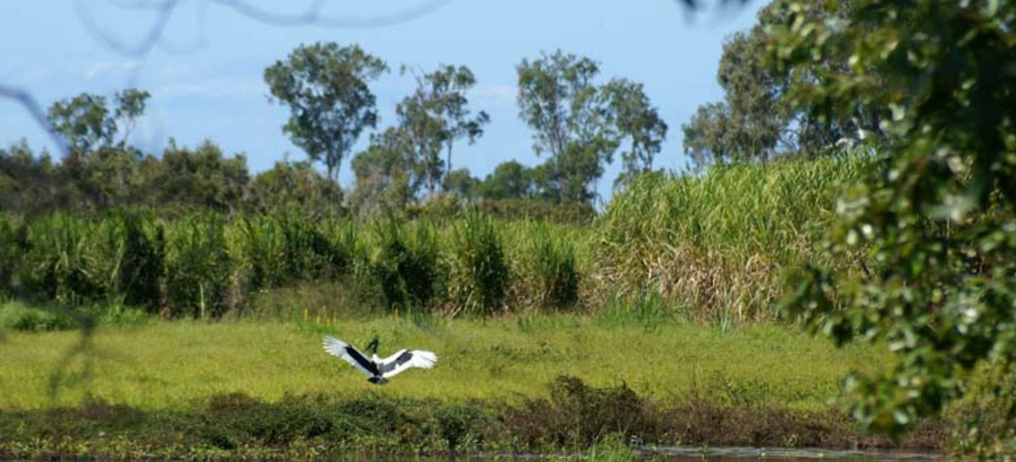
A black-neck stork ( Ephippiorhynchus asiaticus ) at Cattana Wetlands near Cairns, Queensland.