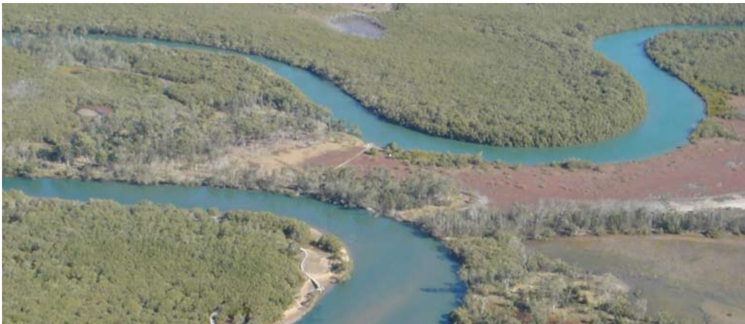
Mangroves and tidal saltmarshes are disappearing around the world at up to 2 per cent a year on average.

Information: 07 3365 2729 mangrovetwatch@gmail.com www.mangrovetwatch.org.au