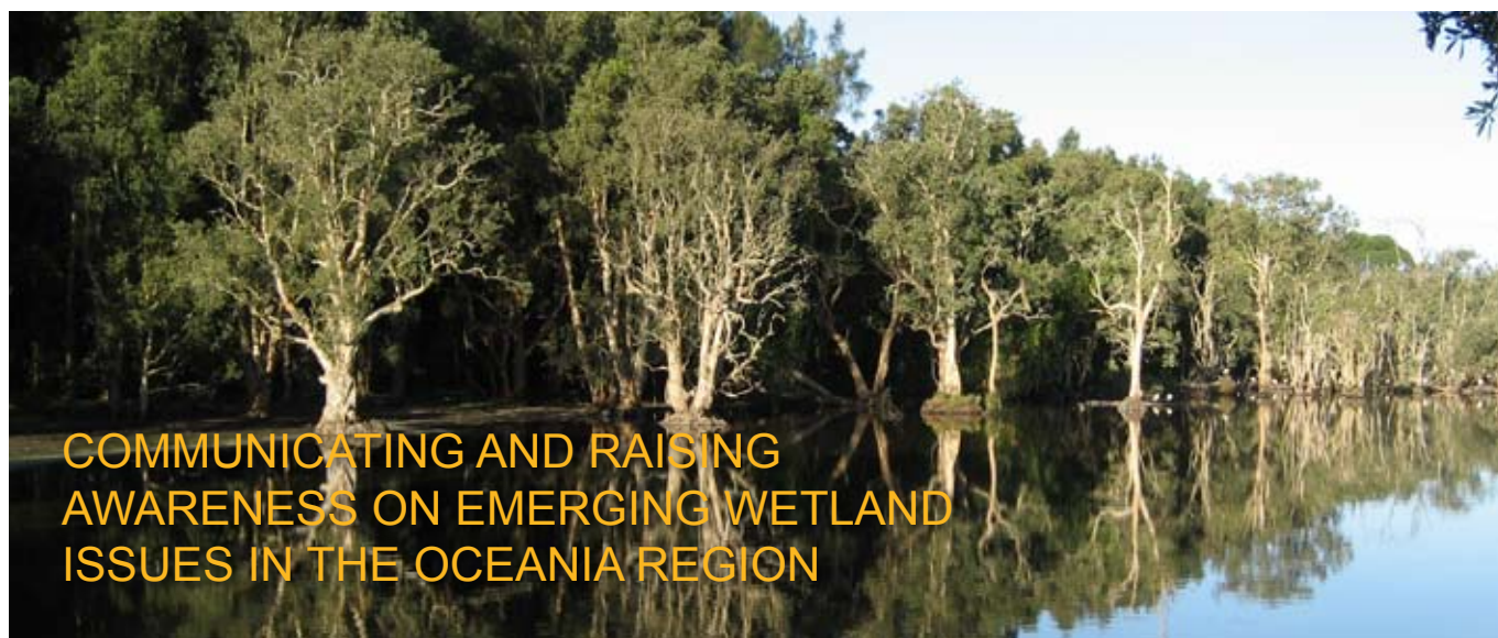
The Hunter Wetlands Centre, New South Wales, the site of the 2009 Wetland Link International Oceania conference.