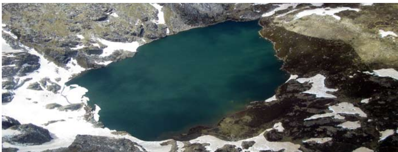
Blue Lake near Mt Kosciuszko, New South Wales.