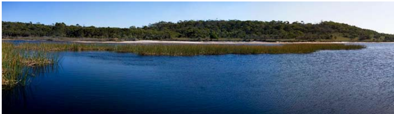
Jocks Lagoon Ramsar site, Tasmania.