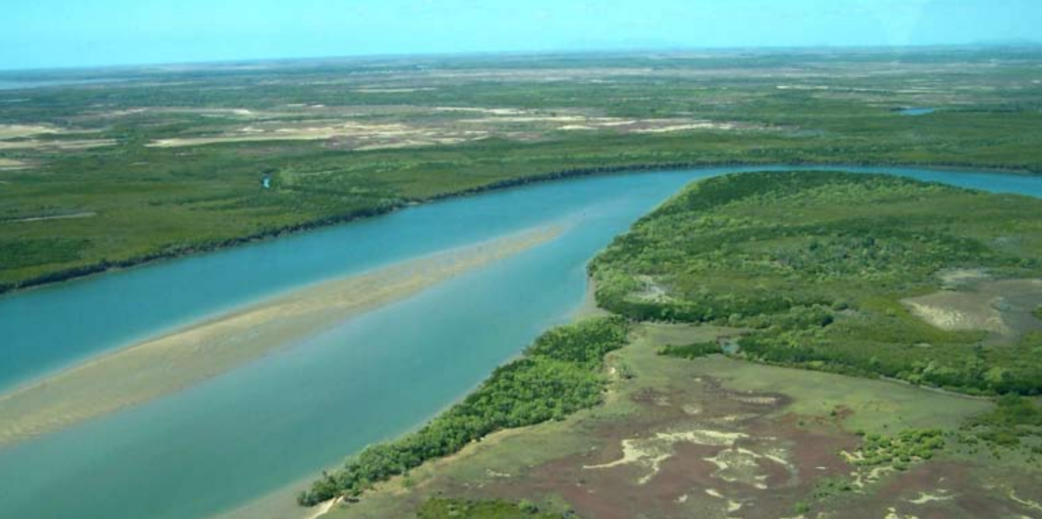
Queensland's Bowling Green Bay Fish Habitat Area protects mangroves and saltmarshes such as those adjacent to Barramundi Creek.