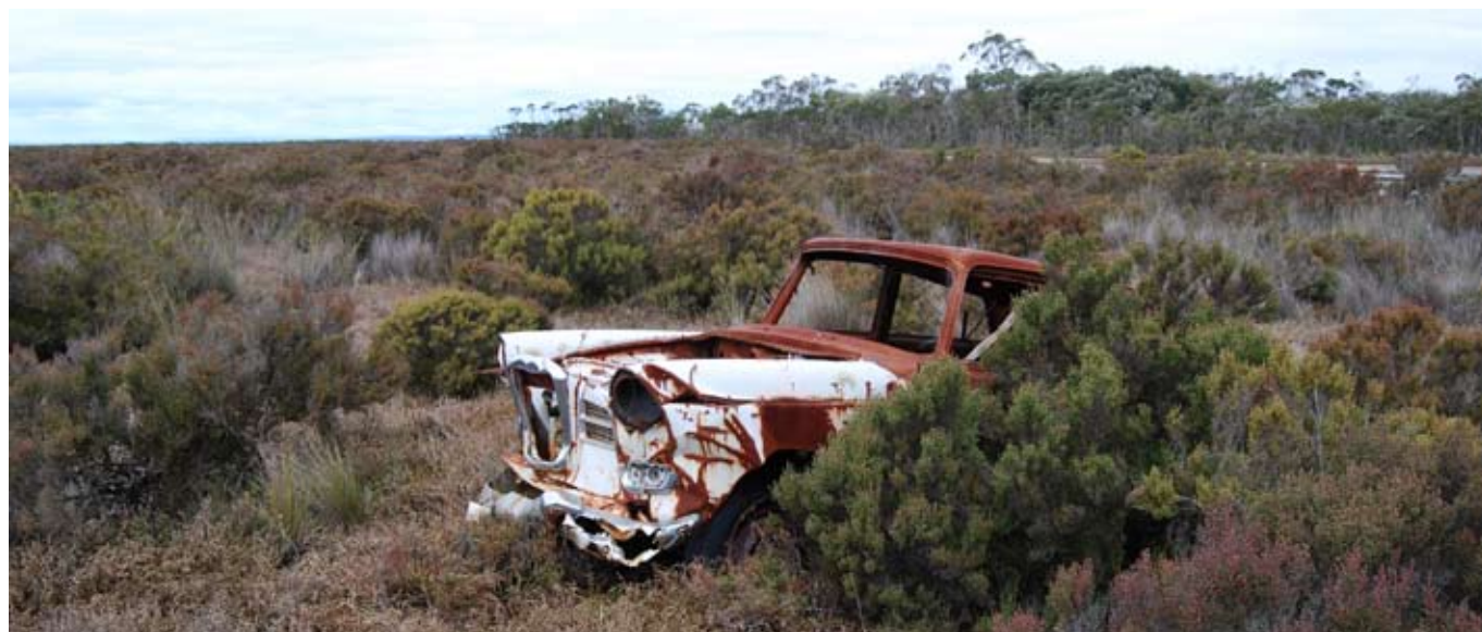
Estimates of the area of saltmarsh in Victoria range from less than 60 km 2 to more than 130 km 2.