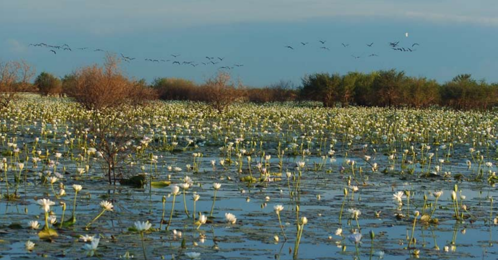
Mutton Hole Wetlands, Normanton, Queensland.