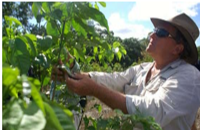
Monitoring the progress of a Papilio ulysses on a host tree.

Participant feedback from 15 events, which are informal (for example community markets), formal (special interest group meetings) and school-based (talks to year-groups), will be correlated to the topics (water quality, flora, fauna, biodiversity, etc.). This impact assessment will compare short (immediately after the event) and long-term effects (six months later) on participants. It will identify which aspects are most clearly recalled, or which stimulated changes in participants' views of the value of wetlands, and the ability to recall practices that limit negative impacts.