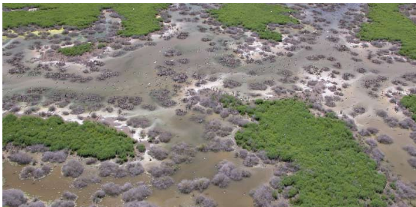
Ibis breeding colony site, Channel Country.

These findings demonstrate the importance of widespread networks of inland wetlands, comprising complementary wetland types across multiple river systems. The role played by flood events in intermittently connecting these widely-spaced and diverse arrays of important wetlands is a significant part of these critical ecosystems.