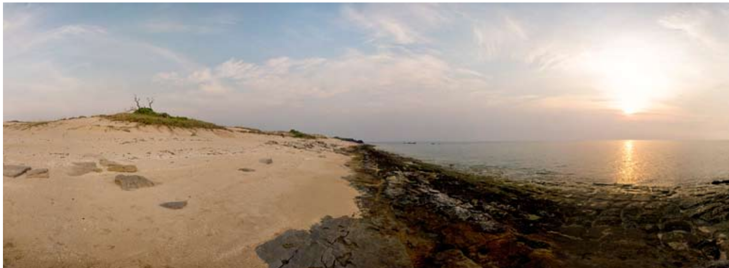
Cobourg Peninsula, Northern Territory, the world's first Ramsar-listed site.