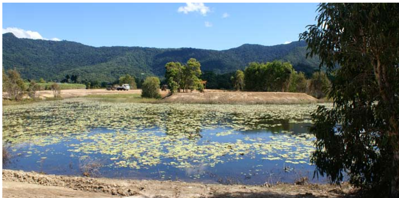
Cattana Wetlands are constructed from mining pits and bordered by urban development.

Information: www.nqit.net/cattana/main.html