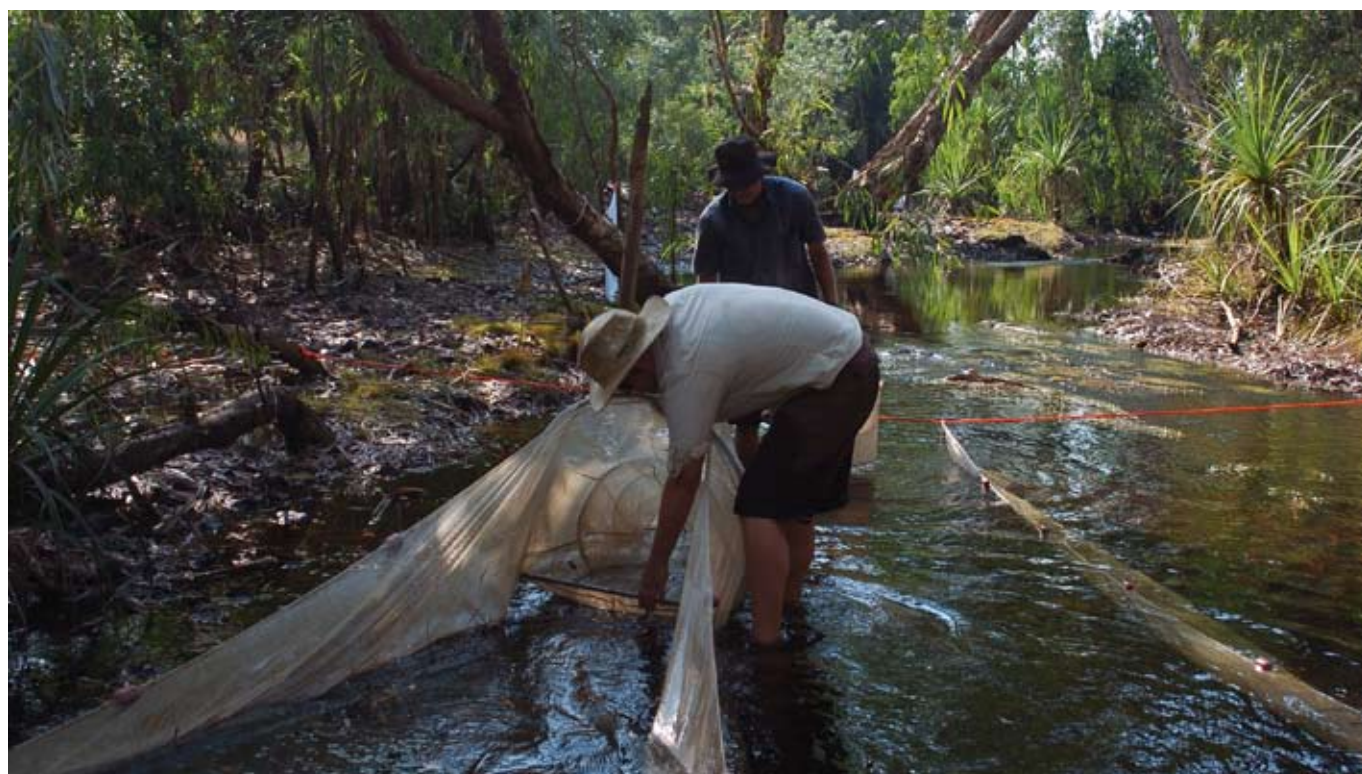
TRaCK researchers check nets for fish and other animals swimming downstream at Edith River, Northern Territory. Top: insects and plants form an important part of the food web in northern rivers.