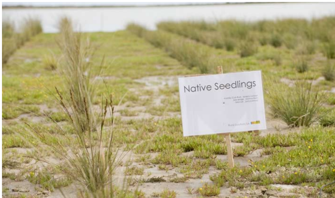
Newly-planted seedlings on the shores of Lake Albert. Left: Barrages between the Coorong lagoon and Lake Alexandrina.

Information: www.murrayfutures.sa.gov.au/lower.php