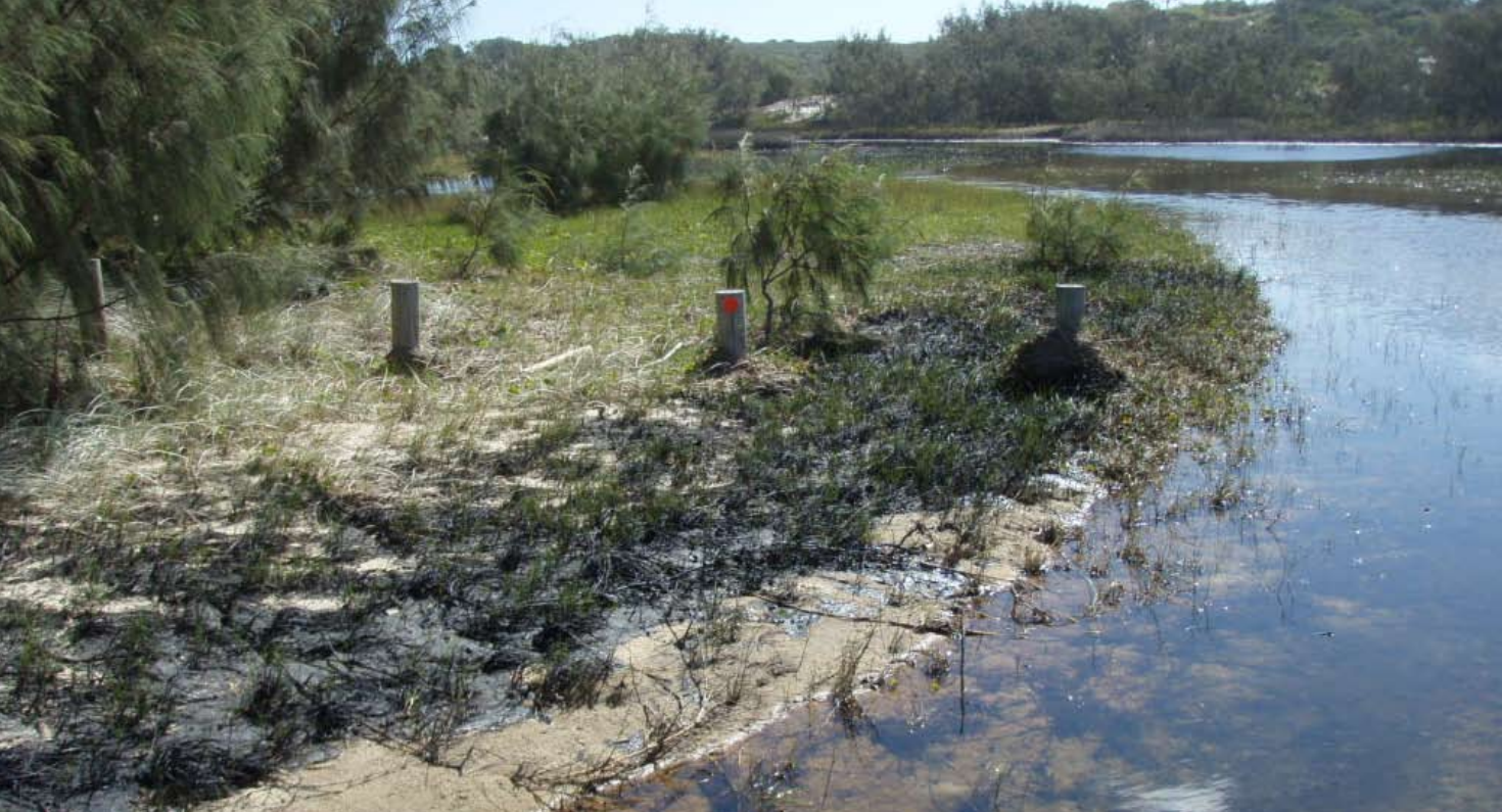
The oil spill that occurred off Cape Moreton in 2009 affected many areas within the Moreton Bay Ramsar site such as Spitfire Creek (above).