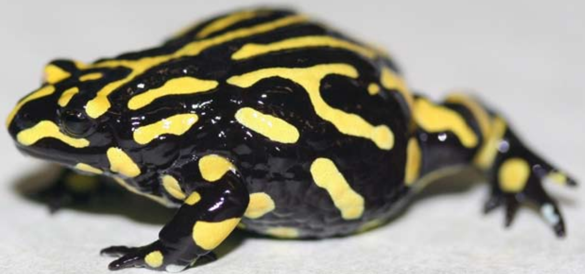
A female southern corroboree frog ( Pseudophryne corroboree ), above and opposite page.