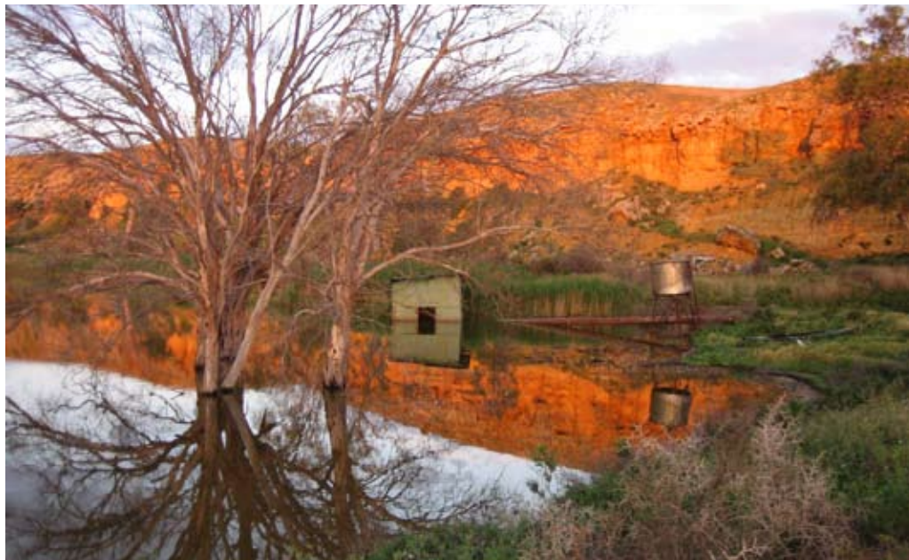
Paiwalla near Mannum, South Australia.