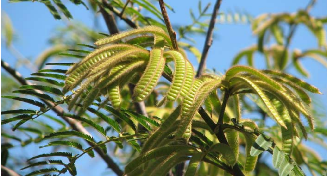
Mimosa green seed.