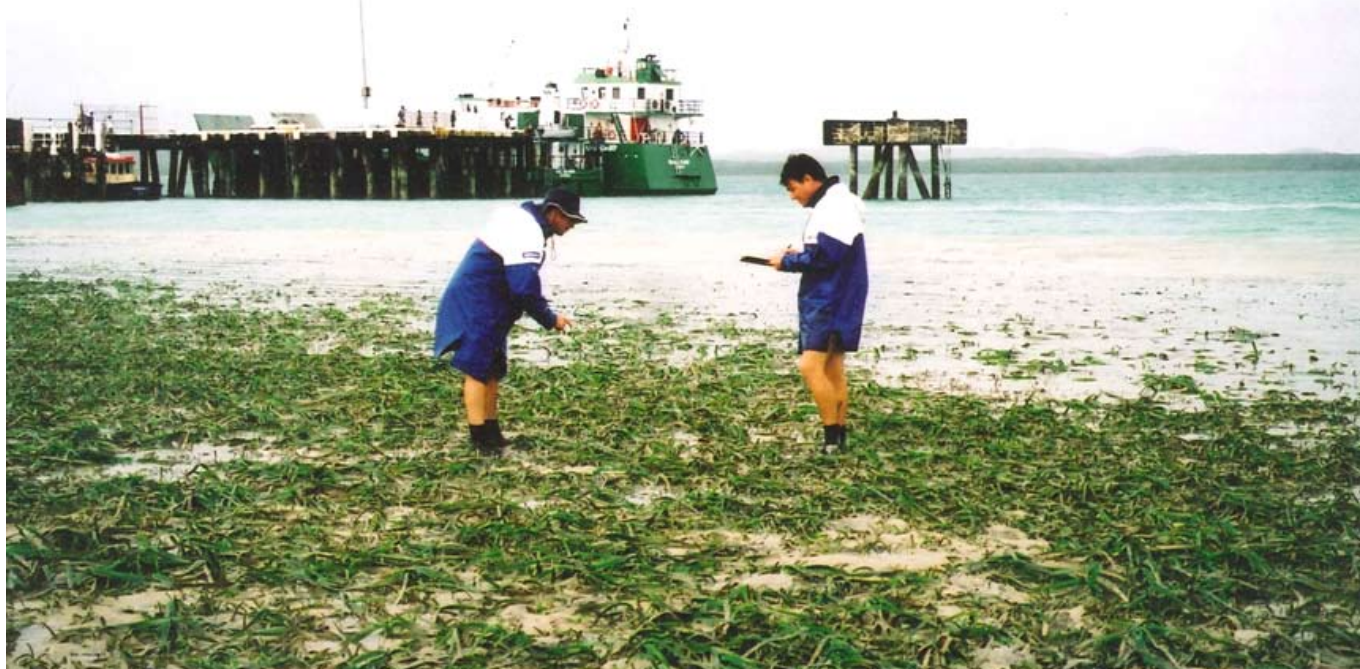
A seagrass status and trend report for the coastline within the Great Barrier Reef area has just been compiled.