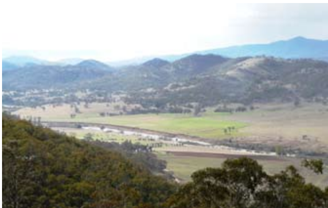
Bumbalong Valley, part of the Upper Murrumbidgee Demonstration Reach, New South Wales.

The Murrumbidgee River is highly valued by residents in the Australian Capital Territory and New South Wales for recreational activities. Consequently, Upper Murrumbidgee Waterwatch has been involving landholders, Parkcare and Landcare groups in monitoring for more than a decade. The keen interest from the Canberra community and riparian landholders in the river's health and its dependent species has made the establishment of UMDR a natural progression for the community to further engage in their waterway.