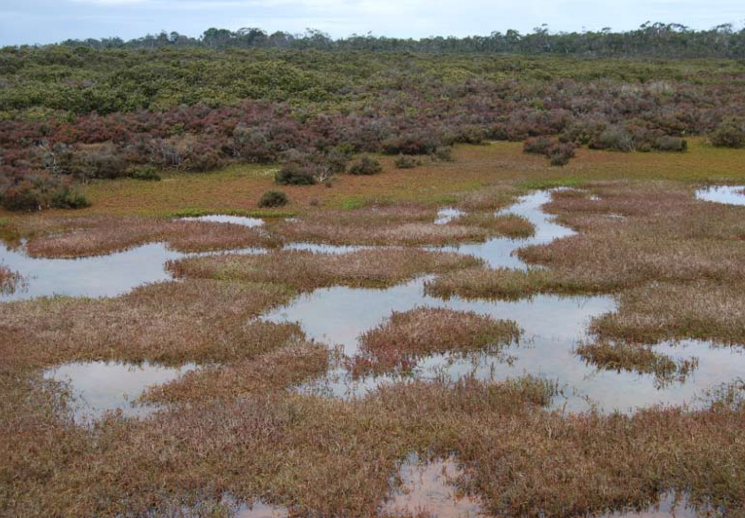
Chenopod-dominated saltmarsh with mangroves.