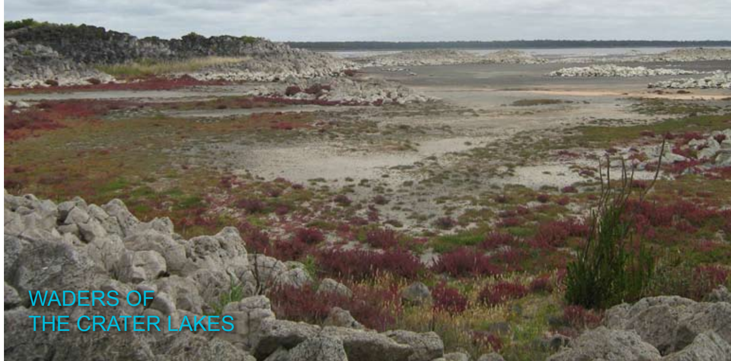
Western District Lakes Ramsar site, Victoria.