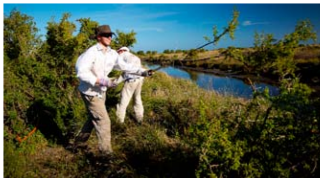
Volunteers removing African boxthorn at Cheetham Wetlands, Melbourne.