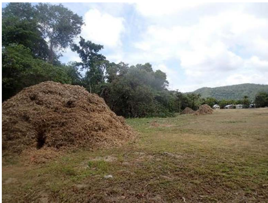
Figure 3: Clearing of vegetation for a residential development adjacent to Littoral Rainforest. The patch was incorrectly defined in Regional Ecosystem mapping but following ground surveys was identified as Littoral Rainforest.

In addition to the direct impacts of land clearing, coastal development can also result in a wide range of other indirect impacts to Littoral Rainforest, such as increased weed invasion, dumping of garden waste and other rubbish, and disturbance to native fauna from domestic pets (BAAM, 2013).