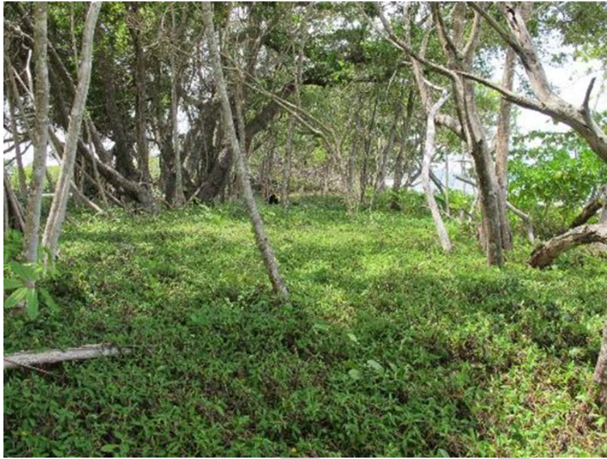
Figure 5: Weed infestation, by Singapore daisy ( Sphagneticola trilobata ), in the understory of a patch of Littoral Rainforest in the Wet Tropics.