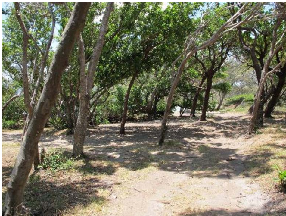
Figure 4: Beach access track through a Littoral Rainforest patch in the Cape York Peninsula bioregion of Queensland.

recreational development, such as campgrounds, is the most common and ongoing key threat to this ecological community (Peel 2010).